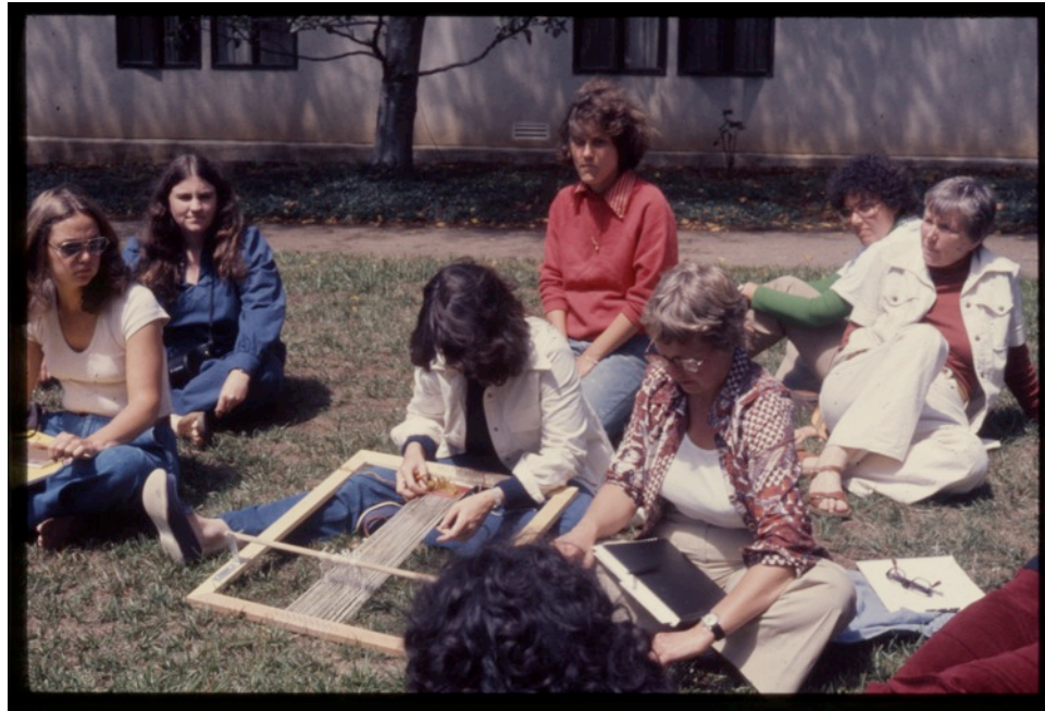
Figure 12: WSPA 1976. Weaving out-of-doors, Architectural Tapestry core course. [SSC RN 7267]