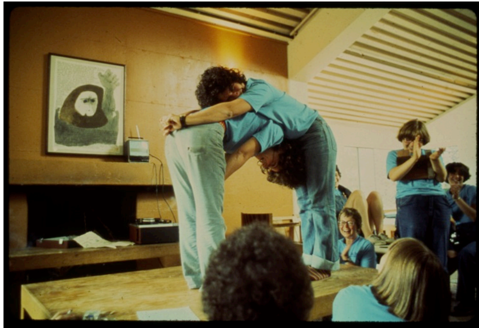
Figure 11: WSPA 1975. Teaching structural principles by using the body to demonstrate loading and lateral forces, Demystification of Tools core course. (Reproduced by permission from Sophia Smith Collection, Smith College. Photographer: unknown.) [SSC RN 7269]