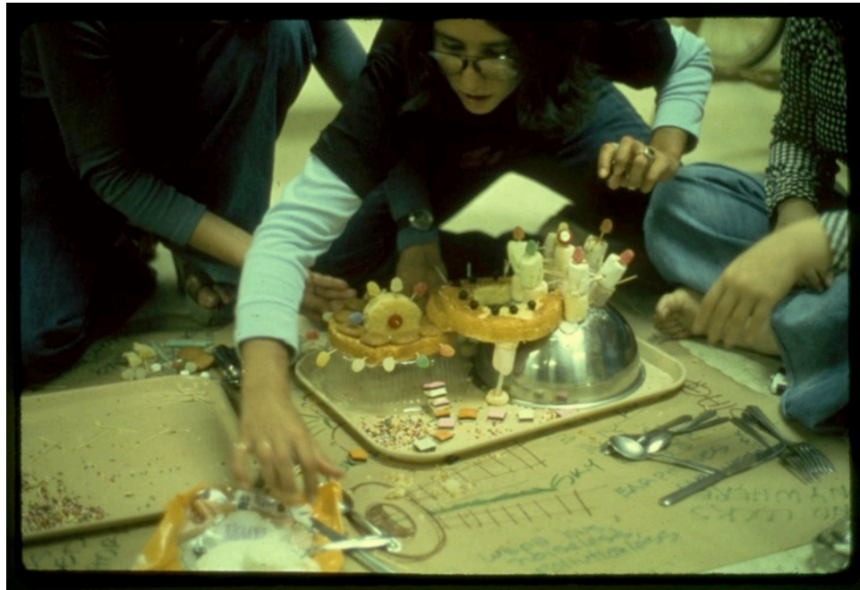
Figure 15: WSPA 1975. Cake campus model. Model constructed of cake, cookies, candy, and sprinkles. [SSC RN 7266]