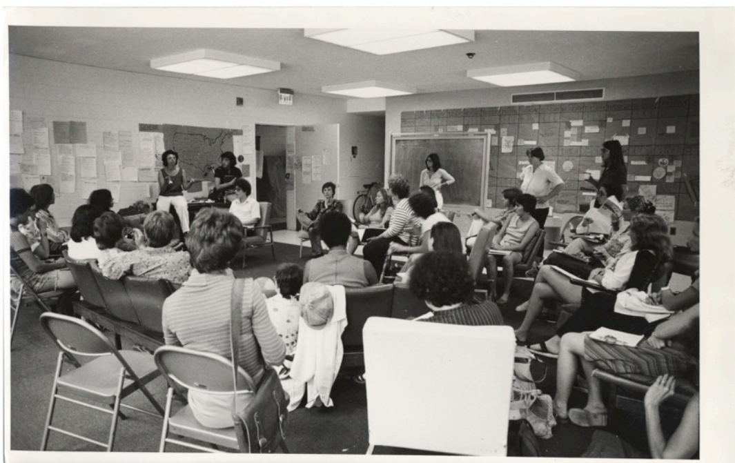
Figure 2: WSPA 1975. All-school meeting, St. Francis College, Biddeford, Maine. [SSC RN 7253]