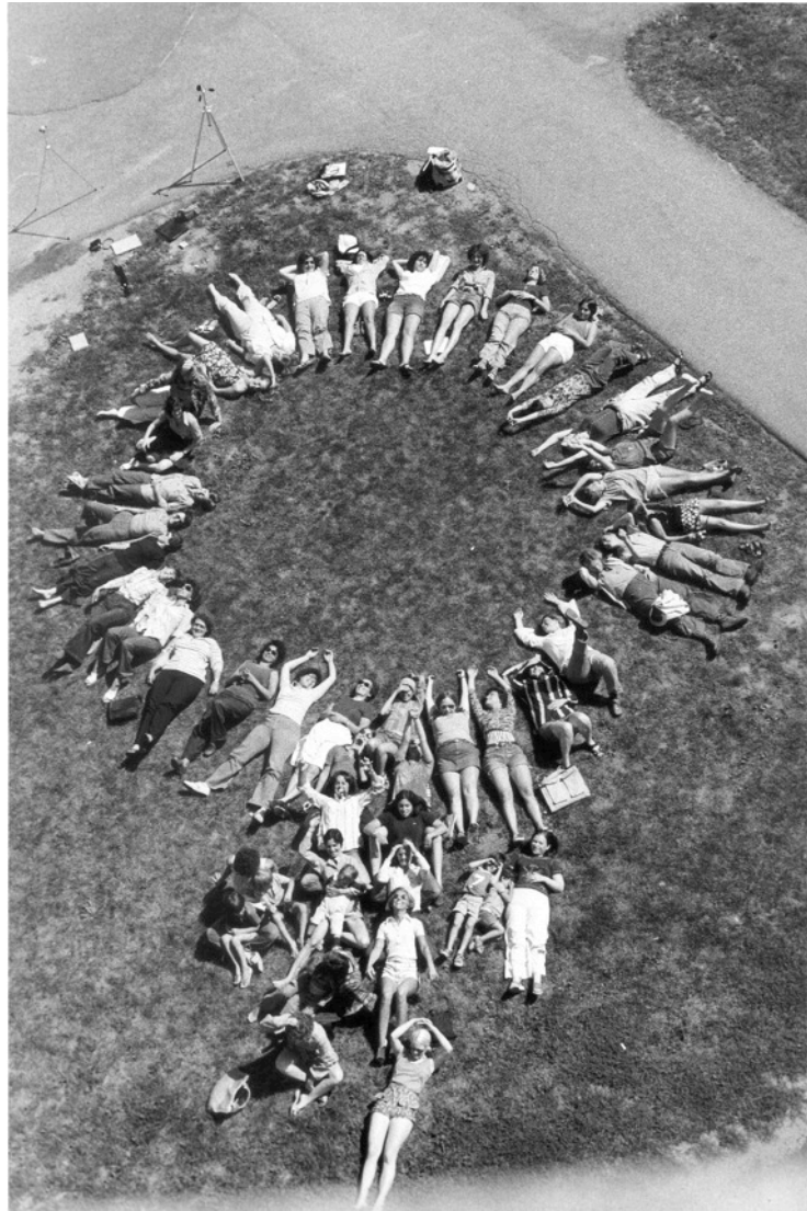
Figure 1: WSPA 1975. Participants form a women's symbol, St. Francis College, Biddeford, Maine. [Sophia Smith Collection Record Number (SSC RN) 546]