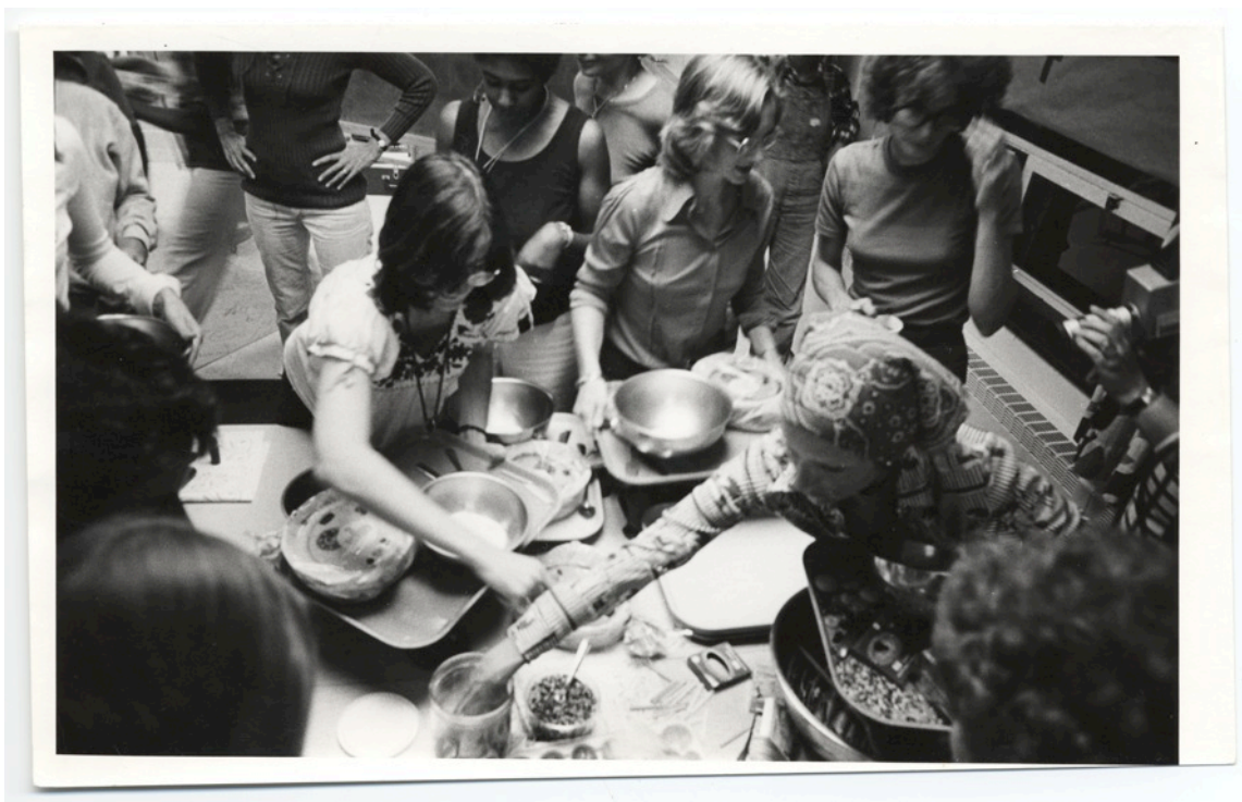
Figure 14: WSPA 1975. Evening all-school session to design ideal WSPA campus. Materials provided included cake, cookies, candy, and sprinkles. [SSC RN 7261]