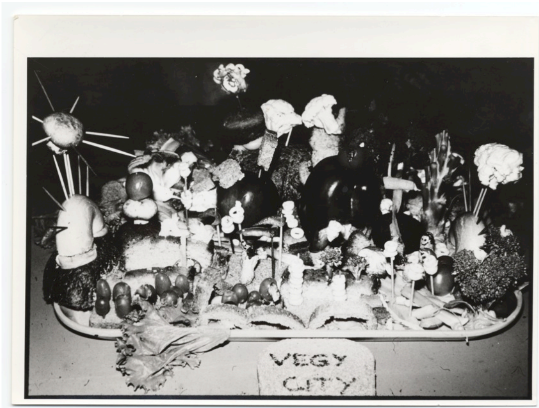
Figure 16: WSPA 1976. Vegy City (sic) campus model. Model constructed of vegetables and bread. [SSC RN 7264]