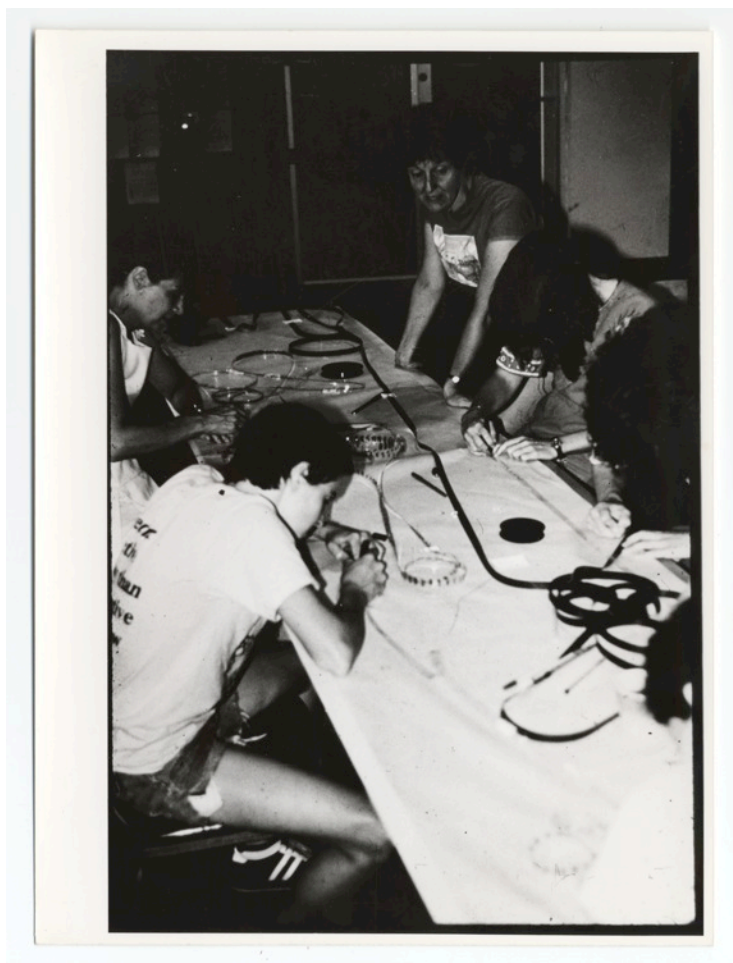
Figure 22: WSPA 1976. Participants learning to splice film. [SSC RN 7263]