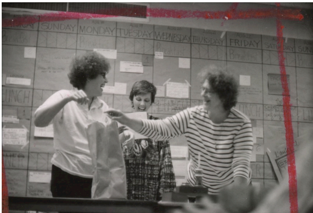
Figure 18: WSPA 1975. All-school session to award the Prix de Biddeford.