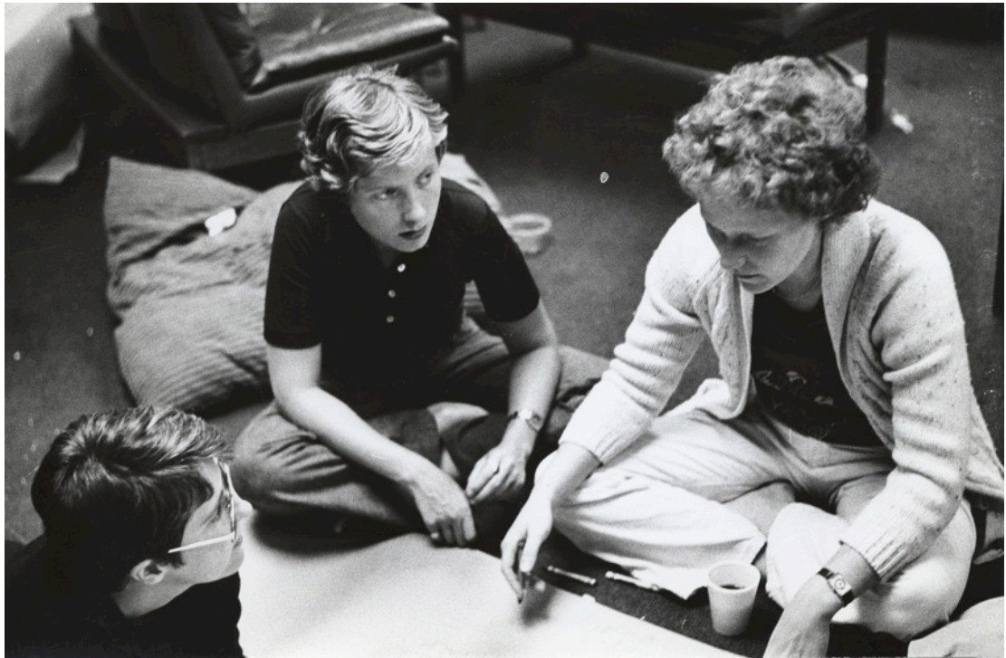
Figure 5: WSPA 1975. Three women designing together, Women and the Built Environment core course. (Reproduced by permission from Sophia Smith Collection, Smith College. Photographer: unknown.) [SSC RN 7256]