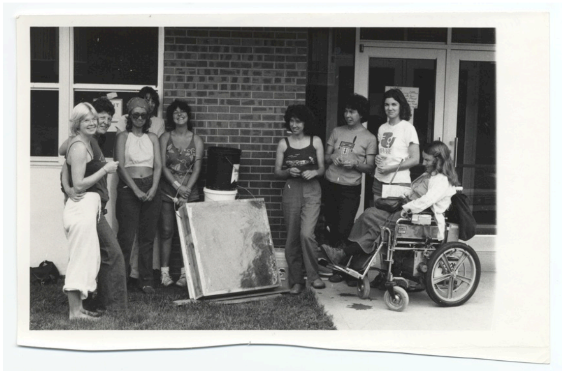
Figure 13: WSPA 1979. Participants with solar collector they built. [SSC RN 7265]