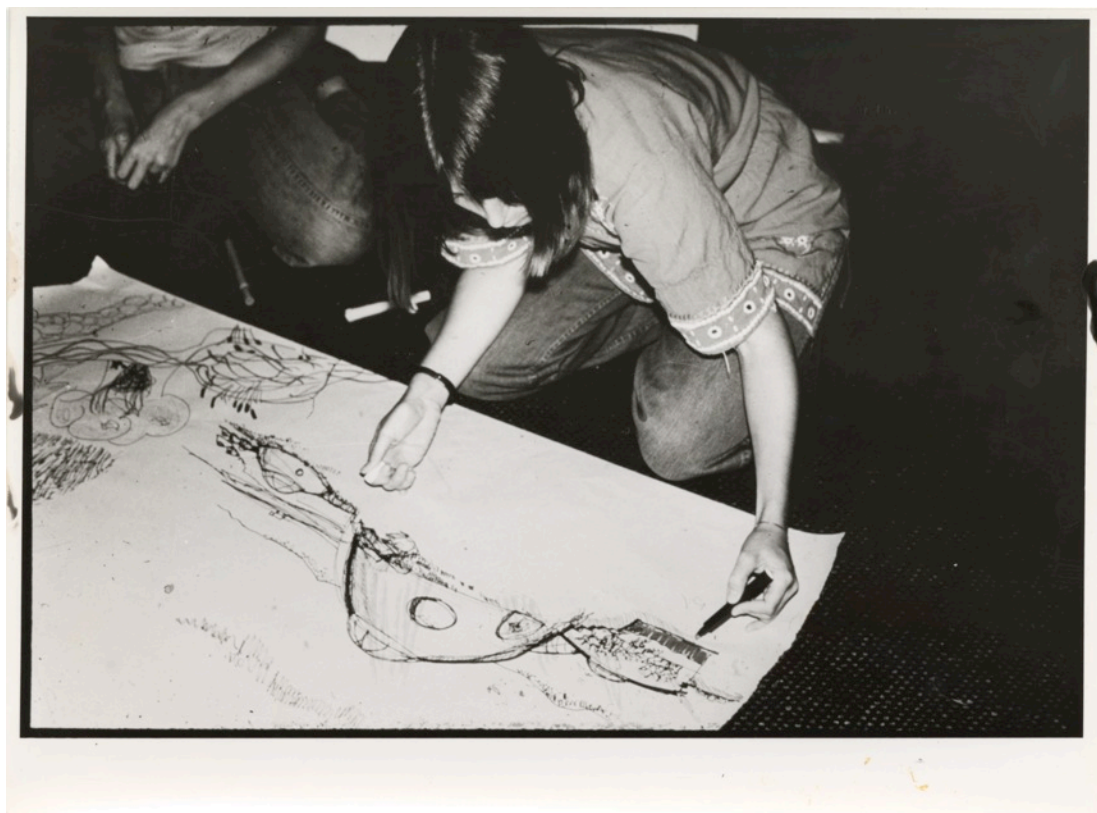
Figure 6: WSPA 1975. Drawing a fantasy environment, Women and the Built Environment core course. [SSC RN 7160]