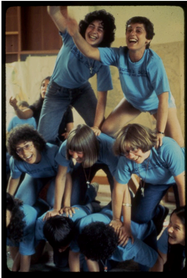
Figure 10: WSPA 1975. Teaching structural principles by using the body to demonstrate loading, Demystification of Tools core course. [SSC RN 7268]