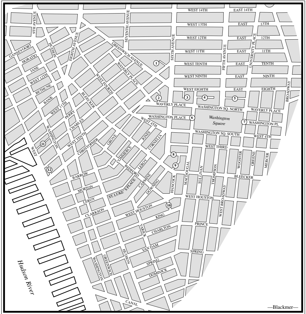
MAP 1. Greater Greenwich Village, 1900.