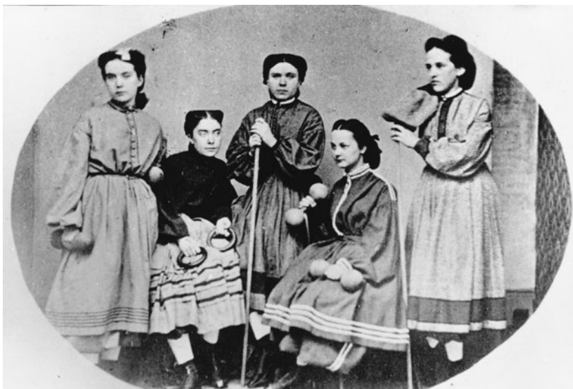
Gymnastic team, Mount Holyoke College, 1865. All five wear personalized and probably homemade versions of Dio Lewis's gymnastic dress.