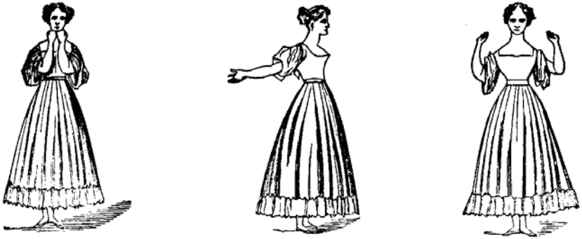
Illustrated exercises from Godey's Lady's Book , 1848, using the same illustrations published some ten to twenty years earlier in The Young Girl's Book .

1856 show a sort of amalgam of a dress more like one published in Godey's in 1848, which in turn borrowed directly from an even earlier book dating from the late 1820s or 1830. 19 It had a higher-than-natural waist, a bell skirt shortened to above the ankle, and short sleeves that are full and fall as the arms are raised, all characteristic of fashionable dress from the very late 1820s and early 1830s. Significantly, it differs from the earlier model in that the young woman in Beecher's illustration wears pantalettes underneath, more in keeping with the exercise dresses we have already seen, or even the bloomer. But the ties to the bloomer may consist of more than the