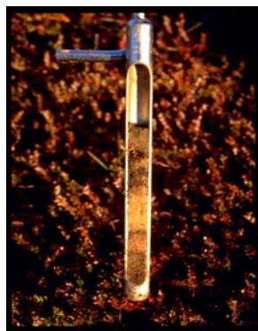
Soil core showing the alternating layers of sand and organic matter typical of a commercial cranberry farm.

both surveys, more than 85% of the sites had soil pH between 4 and 5. Soil pH tends to be lower in well-established bogs. The naturally low soil pH in Massachusetts cranberry bogs is maintained in part by the application of ammonium fertilizers and in part due to low alkalinity in local irrigation water sources.