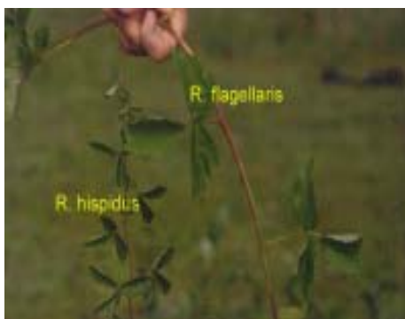
Comparison of R. hispidus (bristly dewberry) and R. flagellaris (prickly dewberry) stems and leaves. Note the heavier stem and wider leaf placement of the prickly dewberry.

Vegetative growth continues until cold weather predominates. Flower bud initiation occurs in the late fall, followed by flower development the next summer on the floricanes (Pritts and Handley, 1989).