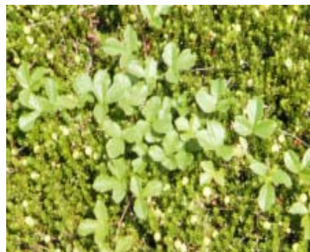
Heavy infestation of bristly dewberry on a commercial cranberry bog.

The most effective way to manage dewberries is to eliminate them as they invade the bog. Remove young plants by pulling or digging out roots. Chemical control with glyphosate wipes is difficult because the weeds grow so intimately amongst the vines. However, wiping does stall