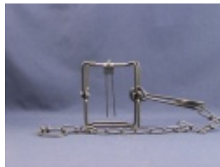
Example of a conibear trap

If non-lethal traps prove ineffective for more than 15 consecutive days or if a muskrat or beaver is posing an immediate threat to your agricultural property, which has caused or is about to cause a loss in production or will prevent normal agricultural practices from occurring, you can receive an emergency 10-day permit from the director of the Department of Fisheries and Wildlife. Emergency permits allow the use of body-gripping (Conibear) traps. Leg-hold traps are not allowed under emergency permits. If there is an immediate threat to human health and safety, applicants can instead request an emergency 10-day trapping permit from your local board of health. A 30-day extension can be sought on both types of emergency permits, if not successful during the first 10-day period.