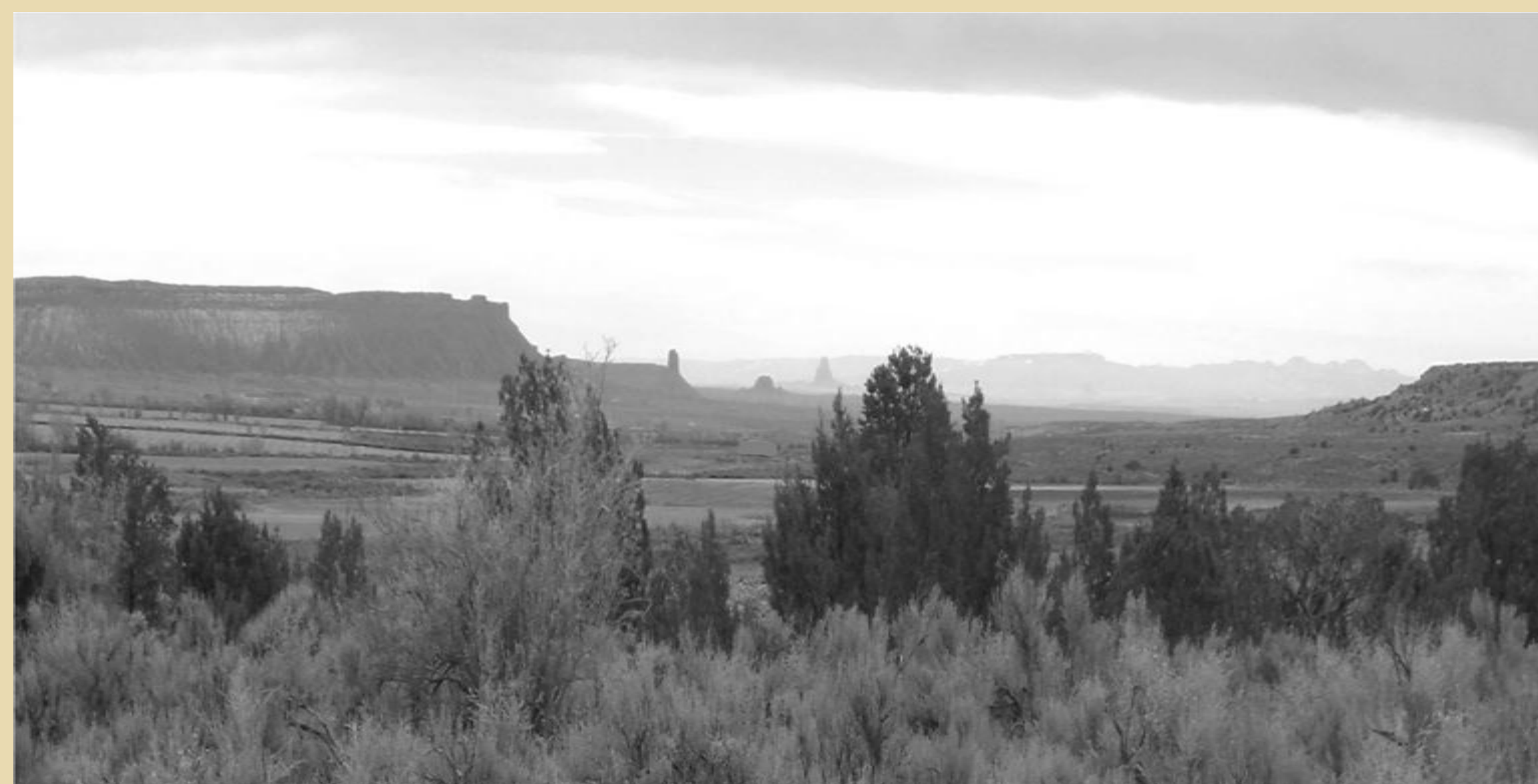
Figure 1. The Montezuma Valley in the Mesa Verde region, looking south toward Shiprock, New Mexico.

This study enumerates taphonomic signatures of some types of violence and warfare that were perpetrated during the Pueblo occupation of the Mesa Verde region (see below). In addition, comparisons of the ages and sexes of victims for the two most violent periods in the Pueblo occupation of the region provide more nuanced understanding of the victims themselves. Archaeological data provide physical and societal contexts in which the violent events occurred.