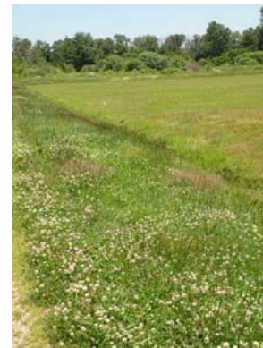
Figure 9. Clover patches may be visited by foraging native bees after bloom. Consider leaving unmowed patches.

Create undisturbed bee zones for ground-nesting bees. Strips of land along around the cranberry bed that are protected by a double row of evergreens as a windbreak or by a hill or hummock would be favorable. Most of the native bees nest in the ground, burrowing tunnels down to chambers where often on south-exposed areas that are dry and warm. Thus, clearing vegetation in a 9'x9' area in very early spring on a sunny slope or on flat bare ground or on a 1-2 yard high bank where the vegetation has been cleared a 3x3 yard area may provide nesting sites. The clearing of sites should occur only in the spring (vegetation would provide insulation for overwintering bees).