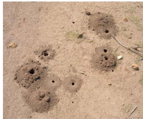
Figure 3. Top: One of the Andrena mining bees. Bottom: typical cluster of ground nest holes.

Other native bees are considerably smaller. Sweat bees (Family Halictidae) are a common group of small bees found on bogs.