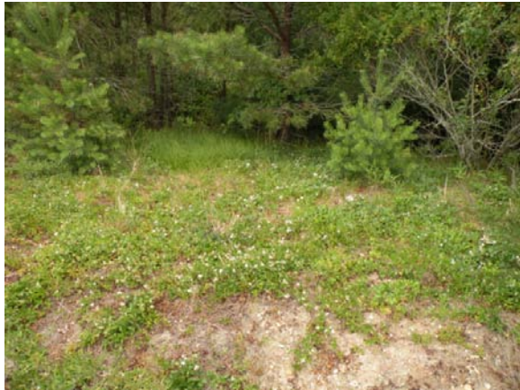
Figure 8. Patch of bee habitat for ground nesters, showing a south-exposed slope as well as a flowering weed patch, but set away from the cranberry bed.

Consider enhancing stands of flowering plants. If floral resources are poor in the foraging area of the bog (before and after cranberry bloom), provide other areas of flowering plants. Blocks of flowers are more attractive and easier to find. The plantings do not have to be very close to the bog, but there is an advantage of having the plantings close to nesting habitats. Choose a large variety of