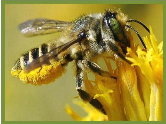
Figure 5. A Megachilidae leafcutter bee. Note that pollen is pressed onto stout hairs on the abdomen's underside.

Leafcutter bees (Family Megachilidae) are also found and are medium-sized native bees. Pollen is carried on the underside of the abdomen, as shown below.