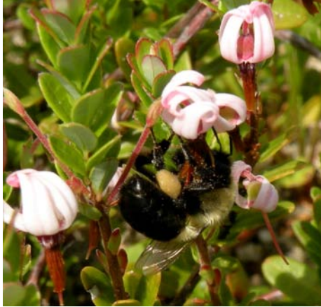
Figure 2. On cranberry, bumble bees are many times more efficient as pollinators because they shake the flower to release pollen.

Some of the most common species of native bees are considerably smaller than honey bees, but may be highly efficient pollinators that forage under poor weather conditions. They may be social or solitary, but most are solitary. In a solitary species, a female constructs and provisions a nest by herself; she typically produces 20-30 offspring. Most solitary bees are active for only a few weeks and have only one generation per year. The different species may be difficult to tell apart.