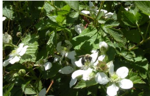
Figure 6. Andrenid on flowers at edge of bog upland

Nesting areas for the many of the solitary bee species are well-drained or sloping ground sites that are free of plants or have patchy areas of bare ground. Others nest in dead/dying trees or rotting logs, particularly in abandoned beetle tunnels.