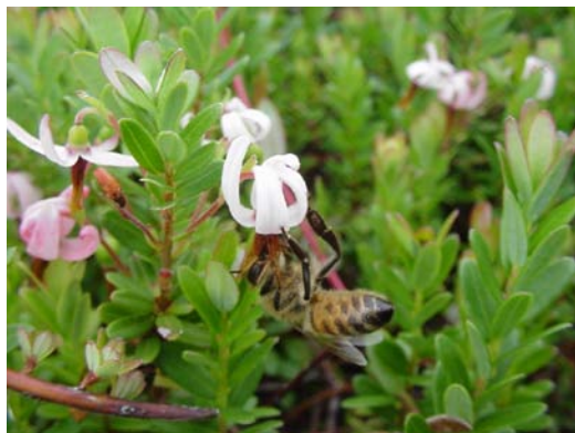
Figure 1. Honey bee on cranberry. Although they are inefficient pollinators of cranberry, they make up for the deficit with numbers: there are thousands of foragers in a healthy hive.

On most cranberry beds, many species of bees are associated with bloom, including bumble bees, mining bees, sweat bees, and leaf-cutter bees. This is in addition to the honey bee, a species introduced to the US nearly 400 years ago by European settlers.