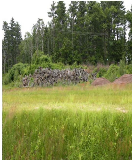
Figure 7. Fencerows, hedgerows, grass mats, and dead trees provide good nesting habitat for native bees.

Conserve and protect good bee habitat After you have determined that good bee habitat exists, take measures to protect it. Leave dead trees standing or piles of tree trunks in place. Allow areas of grasses along edges to create matted areas. Do not disturb patchy bare areas where there are nesting holes. Avoid mowing blooming plants, for example, clover or dandelions that are in grassy areas around the bog or stands of fall goldenrod, that is distant enough to limit risk of invading the cranberry bed. Or, consider