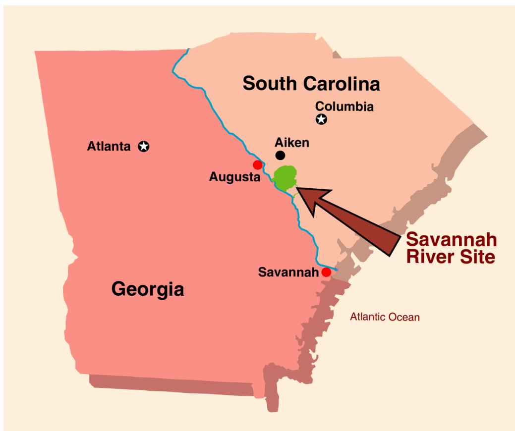
Figure 1. Map of the study area and three fish collection locations on Fourmile Branch of the Savannah River within the Savannah River Site in South Carolina.

Each replicate of the experiment was maintained for seven days. Thus, nine trials were conducted (2 types of illites and 1 control x 3 replicates). Turbidity was measured at hours 1, 2, 4, 8 and 24 on the day clay was applied, and then on the 2 nd , 4 th and 7 th day after application. Turbidity samples were collected in triplicate at 2, 3, 4, 5, 6, and 7 meters of the raceways. Turbidity values in NTU were measured using a LaMotte 2020 Turbidimeter (LaMotte Co., Chestertown, MD). Fish survival was assessed on the 7 th day.