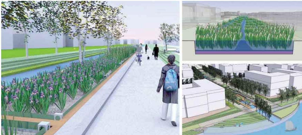
Figure 3: Plants for remediation and waste treatment are green infrastructure as a changing landscape for sensual experience . (Lynch et al, 2008)

and waste water treatment that reduces burdens on existing urban infrastructure. Remediation and self-sustaining systems introduce new landscapes of sensual experiences. The Veringkanal becomes the central spine for arterial lateral branches. Stormwater is collected from the adjacent neighborhood and flows into the canal. These branches simultaneously create a new trail system for pedestrians and cyclists and make the Veringkanal an urban greenway (Figure 3).