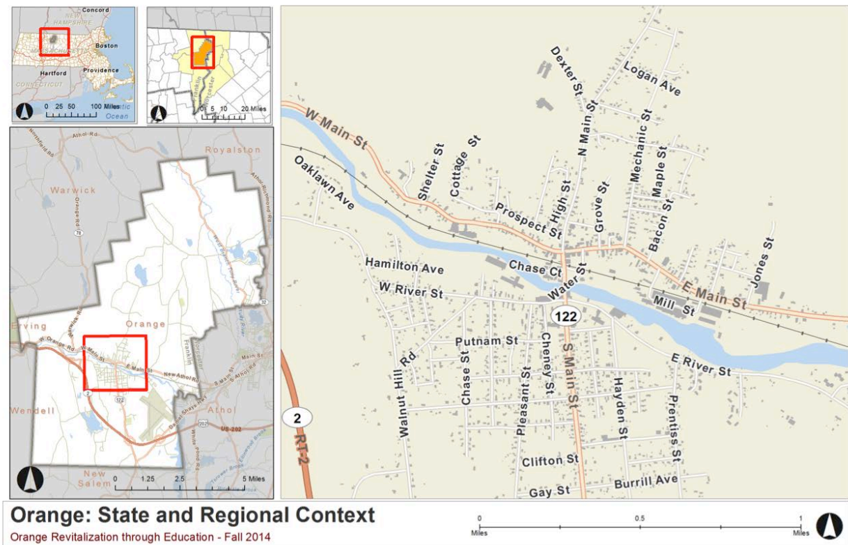
Figure 1: Town of Orange

Over the course of three semesters in 2015 and 2016, the UMass CED has conducted three studies in North Quabbin, particularly in Orange, exploring how the arts can be used as an integral economic development strategy. The first study focused on identifying non-traditional innovative educational opportunities; the second was on the feasibility of an arts education center; and the following will offer an implementation plan to fully transition to an arts economy.