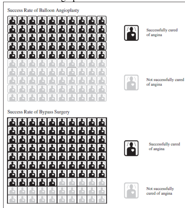
FIGURE 2.1 Pictograph of Statistical Data

In an earlier medical focus study, Schapira, Nattinger and McHorney (2001) found that participants responded best to frequency graphics that use human figures to highlight the risk of breast cancer. In the graphical representation of breast cancer risk presented in Figure 2.2, human figures add contextual meaning to the statistical information by illustrating a nine percent lifetime risk of contracting cancer. Schapira et al.'s (2001) focus group found this format to be easier to identify and more understandable than other forms of statistical representation.