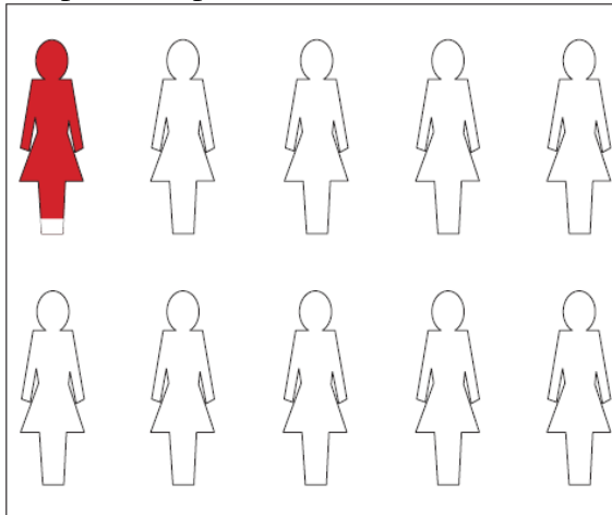
FIGURE 2.2 Graphical Representation of Statistical Risk

Overall, the research suggests that vividness enhancements can be used to successfully improve the chances that statistical data are assimilated into judgments being made.