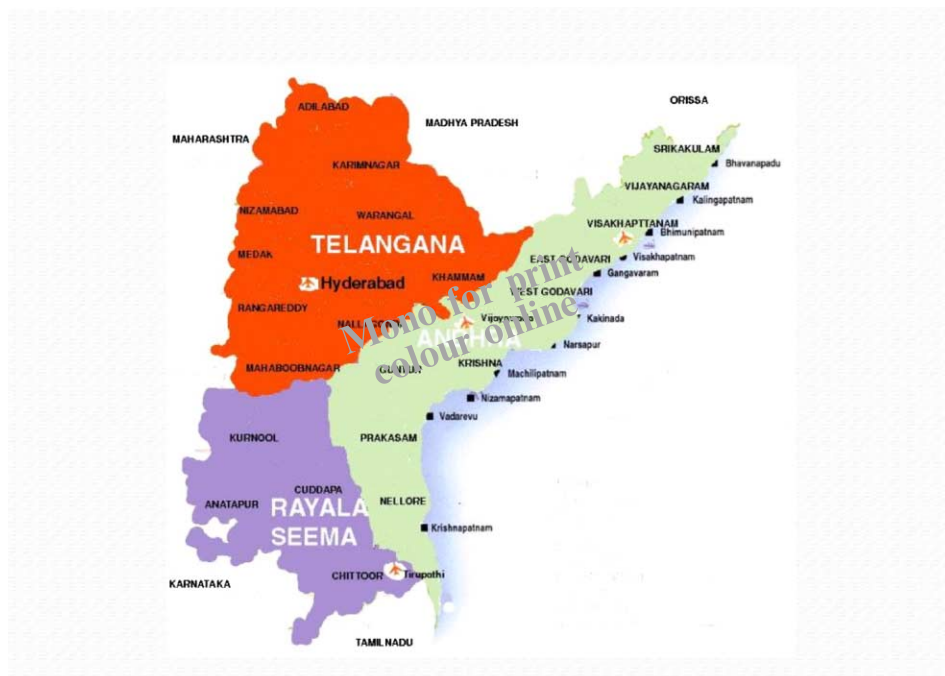
Figure 1. Map of Andhra Pradesh illustrating the three regions: Telangana, coastal Andhra, and Rayalseema.

placed in relation to the people of Andhra and in this partnership the major partner will derive all the advantages immediately while Telangana itself may be converted into a colony by the enterprising coastal Andhra. (State Reorganisation Commission cited in the Sri Krishna Committee Report, Government of India, 2010, p. 6)