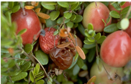
Figure 4. Infested fruit turn red prematurely, starting at the top, and then eventually shrivel up