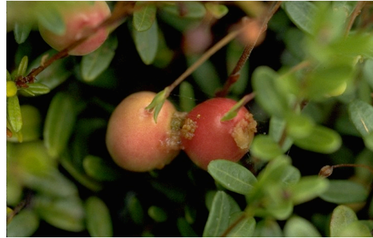
Figure 5. Two berries, lightly silked together by a late instar larva. The larva has travelled from the right to left berry, affording it protection from both natural enemies and chemical applications.

basis or to monitor berries for eggs on a regular basis.