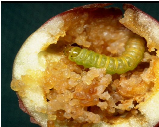
Figure 2. Mature larva may reach 12-16 mm; near completion of development, they have a reddish tint on the rear portion of the body. When fully mature, the larva drops to the bog floor and spins a silken cell of silk that integrates sand and trash, called a hibernaculum