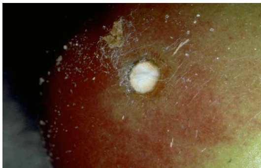
Figure 3. The larva's silken-sealed entrance on fruit