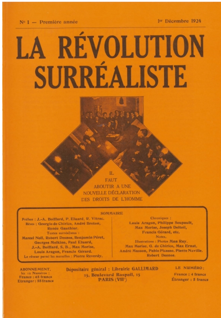
Figure 3. La Révolution Surréaliste 1 (1924), cover.