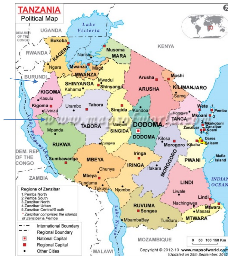
Figure 1: The map of Tanzania with its administrative regions

Rukwa and Kigoma are both situated in the southern highlands of Tanzania. The Rukwa region lies along the remote southwestern border of Tanzania between Lake Tanganyika and Lake Rukwa. To the northwest, Rukwa borders with the Kigoma region, and to the northeast, with Tabora, and to the southeast, with Mbeya. To the south, Rukwa borders with Zambia and partly, with Congo DRC. It is one of the largest and one of the least populated regions in Tanzania.