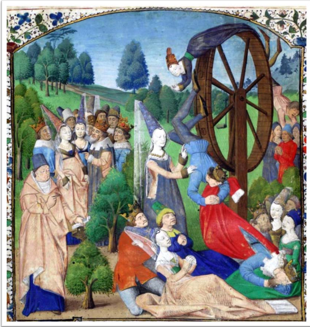
Figure 1. Miniature depicting Fortune and her Wheel. School of the Coëtivy Master. Detail. Les cas des nobles hommes et femmes . Translated into French by Laurence de Premierfait. University of Glasgow. MS Hunter 371, fol. 1 r . 1467.