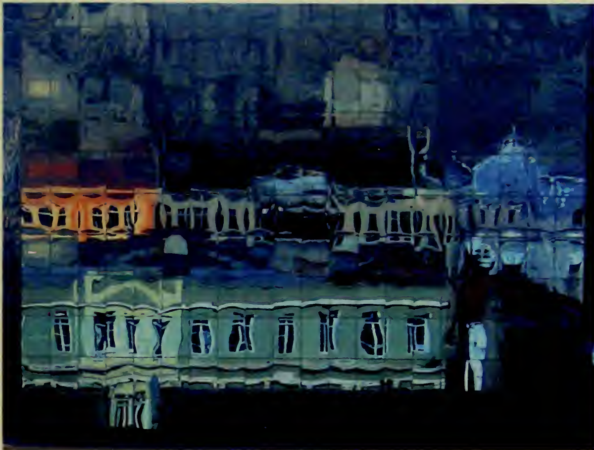
Valparaíso Reflected Alexa Roscoe