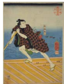
Figure 19: Sōta Kuniyoshi From ARC