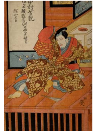
Figure 7: Shikan Toyokuni

It was Utagawa Toyoharu 歌川豊春 (1735 – 1814) who founded the Utagawa School. He studied first at the Kanō School 狩野派 in Kyōto, and then he went to the city of Edo and learned his technique under Toriyama Sekien 鳥山石燕 (1713–1788). Thus his technique was diverse, with an especially notable perspective method of painting called uki-e 浮絵. His technique was seen in many theatrical posters. His school included disciples such as Toyohiro 豊広 (1773 –