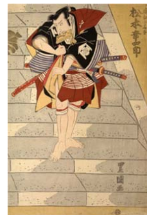
Figure 9: Kōshirō Toyokuni

1865), Kuniyoshi 国芳 (1798 –1861) and many others.