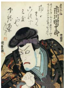
Figure 15: Danjūrō (1) Kunisada

because the eyes are bigger and the lines