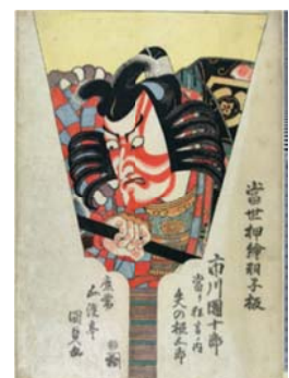
Figure 16: Danjūrō (2) Kunisada

Kunisada. When readers view the three images, Figure 14-16,