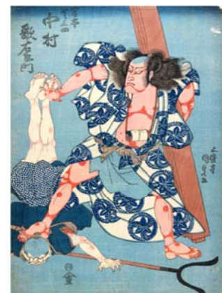
Figure 14: Utaemon Kunisada From ARC

garments are very bold and fresh eye opening, in fact. Even the ways women's garments are depicted reflect the Edoite's fondness for vertical stripes. This was the trend in the city of Edo. Most obviously, the actors' facial expressions are tending toward one pattern, one that is a different from the Torii School, as the Utagawa School was rather a comical one. It is as if readers are turning the pages of a comic book