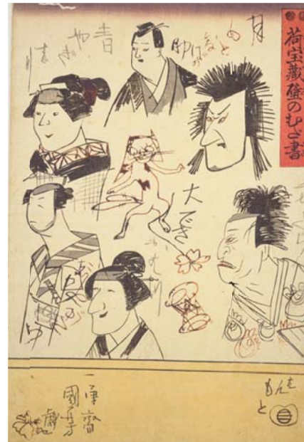
Figure 20: mudagaki Kuniyoshi

Figure 20 is outstanding in a different manner, as it was an effort to escape from the Edo government's prohibition that was included in the anti-extravagance regulations in the Tenpō Reforms (1841 -1843) to paint actors' portraits. For this drawing, that artist pretended that he had quickly scribbled the work as if it were a child's work. Indeed, the Edo government was never able to arrest him for breaking the law. Instead of breaking the law, Kuniyoshi used his humor to taunt the law. This was typical of Edoite's humor.