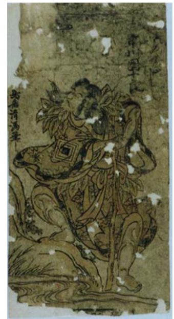
Figure 6: Ichikawa Danjūrō (2) Kiyomitsu From Waseda Enpaku

exaggerated posture, makeup and costume).