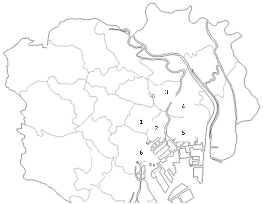
Figure 2: Present Tokyo 23 Wards

How could Tsutaya Jūzaburō promote so many artists without having any personal hereditary advantages such as the social connections and the financial backing enjoyed by the Suharaya 須原屋 or his rival publisher, Izumoji 出雲寺 clans? How could Tsutaya Jūzaburō make his business so successful and competitive against the prestigious shomotsu don'ya 書物問屋 and jihon don'ya 地本問屋 such as the Suharaya 須原屋 clan, and Tsuruya 鶴屋 clan? Why was his work embraced by so many citizens in the city of Edo? Lastly, why did this business decline so drastically after Tsutaya Jūzaburō the First died? There must be some reasons for this quick popularity and quick decline of the Tsutaya Jūzaburō publishing house.