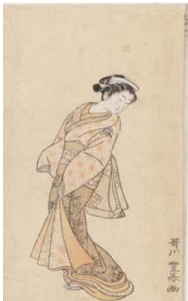
Figure 10: Toyoharu

Figure 8 is of Iwai Hanshirō 岩井半四郎. The last portrait, Figure 9, is Matsumoto Kōshirō the Fifth 五代松本幸四郎. I should compare his portraits to his