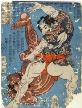
Figure 17: musha-e Kuniyoshi

people see that the gestures and expressions are overly exaggerated. The facial expressions, especially the eyes, are unique. Most eyes are cross-eyed. Their lips are turned up and their lower jaws protrude. The colors are not brighter than those of Toyokuni the First as more blue is applied. The lines are much bolder and the gestures are somewhat unrealistic.