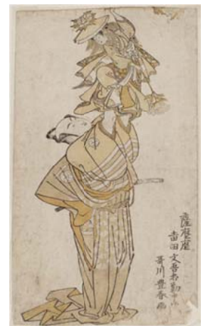
Figure 11: Yoshida Bungo Toyoharu

features are very grand, similar to what I find in the work of his disciple later.