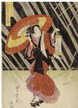
Figure 8: Hanshirō Toyokuni

Toyohiro was Hiroshige the First 初代広重 (1797 –1858), who was famous for his landscapes in ukiyo-e . Following Toyokuni the First, who developed the Utagawa School's traditional style, were Kuniyasu 国安 (1794 – 1832), Toyokuni the Second 二代豊国 (1777 –1835),