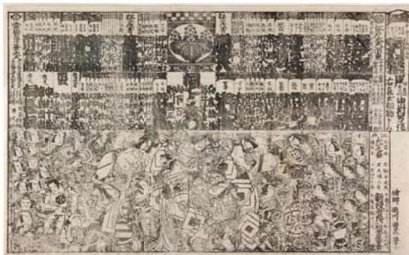
Figure 12: ranking list Toyoharu From Museum of Fine Arts Boston

Figure 12 is a ranking list of actors in the month of November of 1786. It reminds most people of the Torii School style, and it confirms the popular notion that Toyoharu once did this sort of work for a living.