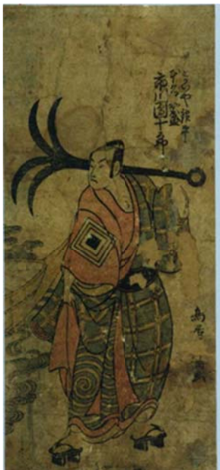
Figure 5: Ichikawa Danjūrō (1) Kiyomitsu From Waseda Enpaku

The Torii School still retains the features of “gourd legs and earthworm outlines (瓢箪足 hyōtan ashi 蚯蚓画 mimizu gaki )” which was established by Kiyonobu the First as we see in Shussse Sumidagawa 出世隅田川, written by Ichikawa Danjūrō 市川団十郎 and illustrated by Torii Kiyonobu 鳥居清信 in Figure 4.