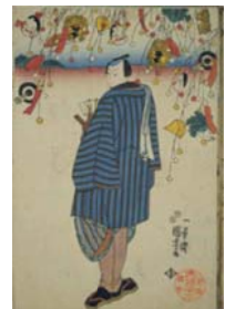
Figure 18: unknown actor Kuniyoshi From ARC

It is modern, even though the basic touch is the same as Toyokuni. Kuniyoshi's illustration includes a sophisticated and well-balanced taste in color and design.