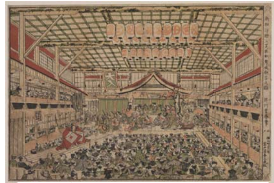
Figure 13: kabuki theater Toyoharu

Now let's go back to Figures 7- 9 of Toyokuni the First. I realize the difference in the use of colors in his images differ from those of his teacher. He uses the colors fearlessly, based on black and brownish red along with purple and green. Patterns of the