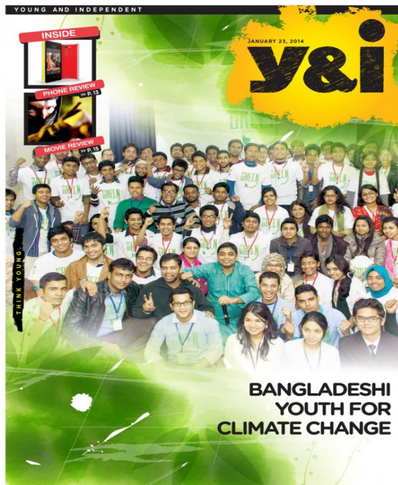
Figure 2: BGreen Media Amplification

On top of extensive written features, we also landed covers of magazines and news supplements nationwide, with the main story in the magazine being featured around BGreen and its goals for social change. This was significant for us, as this particular newspaper has the country's third largest readership.