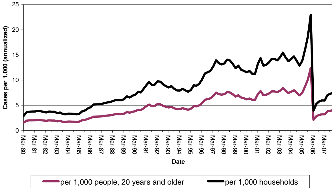
Figure 1: U.S. Bankruptcy Rates Relative to Different Population Measures, March 1980 to December 2007

Notes: Aggregated data of state-by-state filings. Sources are the AOUSC (2008) and Census (2008a, 2008b).