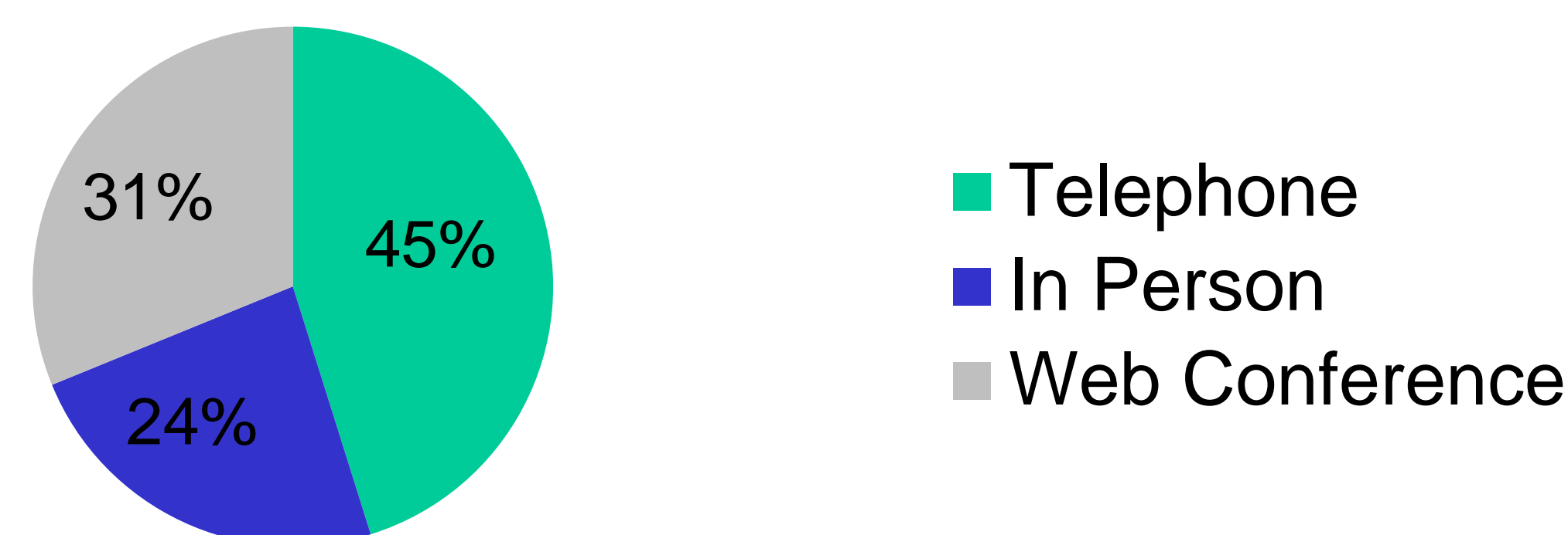
Figure 1: Scheduled Consults by Type September 2016-March 2017

When the average length of each type of consult was calculated, web conference consults averaged 36 minutes long, in-person consults were an average of 37 minutes long, and telephone consults were 26 minutes long (Figure 2). After running an analysis of variance, the length of in-person and web conference consults varied enough from telephone consults to be statistically significant ( p < 0.05 ). This is one indication that web conference consults more closely approximate the in-person research appointment experience than do telephone consults.