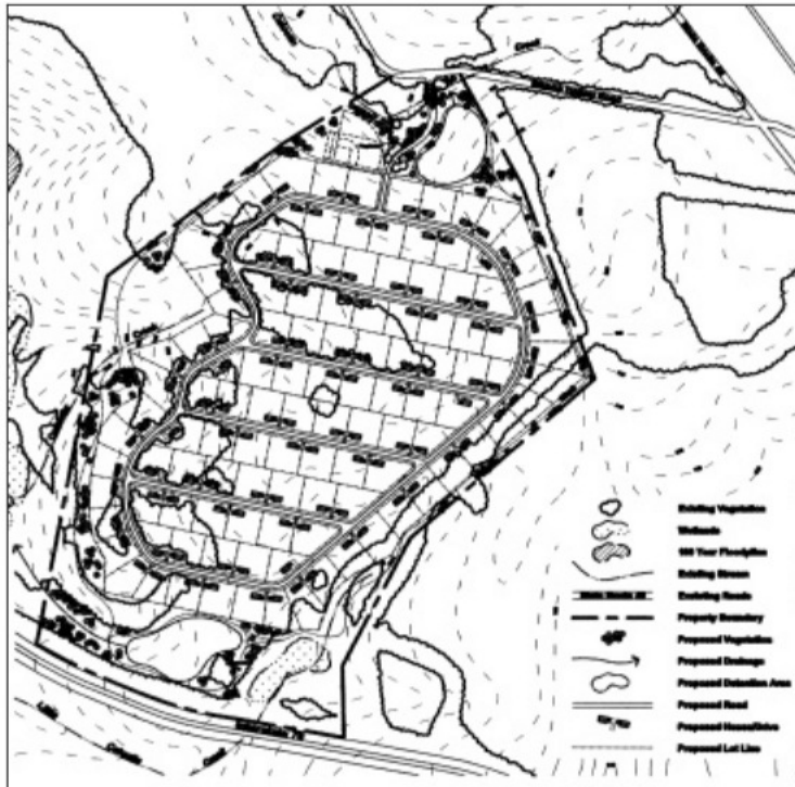
Figure 3: Scenario 3 showing modified conventional development pattern using design tools to reduce impervious surface.

Scenario 3 (figure 3) presents a compromise between the two, applying a variety of design tools to a typical R-1 large lot layout. All three site plans are based on sanitary sewer access for each home.