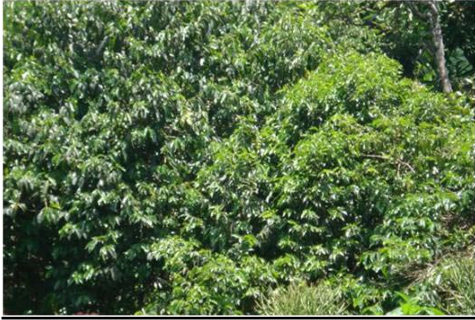
Figure 2. Peasant owned coffee plantation.

The Oromo who traditionally personalize the earth always wish it to be covered with plants. They equate land without plant cover with a naked person. In their tradition, land void of vegetation results in cracks which is metaphorically become mouths by which it speaks to Waaqa the fact that the people are violating safuu (norms) and feedha Waaqaa (will of God). Furthermore, the cracks are considered as cracking baby's body due to lack of clothing and butter (traditional body oil). Planting trees including coffee plantation is believed to be clothing the earth and appeasing Waaqa .