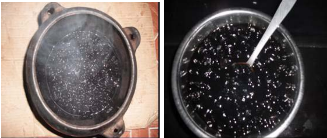
Figure 4. A. Buna qalaa being prepared

Coffee berries are also one of the important components of Oromo traditional food known as Qorii . Qorii is prepared from toasted coffee berries and barley, which is mixed up with refined and spiced butter are used along with the regular coffee. Coffee is also used as a medicine among the Oromo. Primarily it is used for the treatment of discomfort and illness such as a headache. In this regard, a person suffering from a headache is advised to drink cups of coffee. During long journeys, a traveling person takes with him/herself toasted coffee berries. In case the traveler encounters any illness he/she first smells the coffee berries, placing the berries in his/her nose for the betterment of health. If this does not bring change the berries are chewed and swallowed.