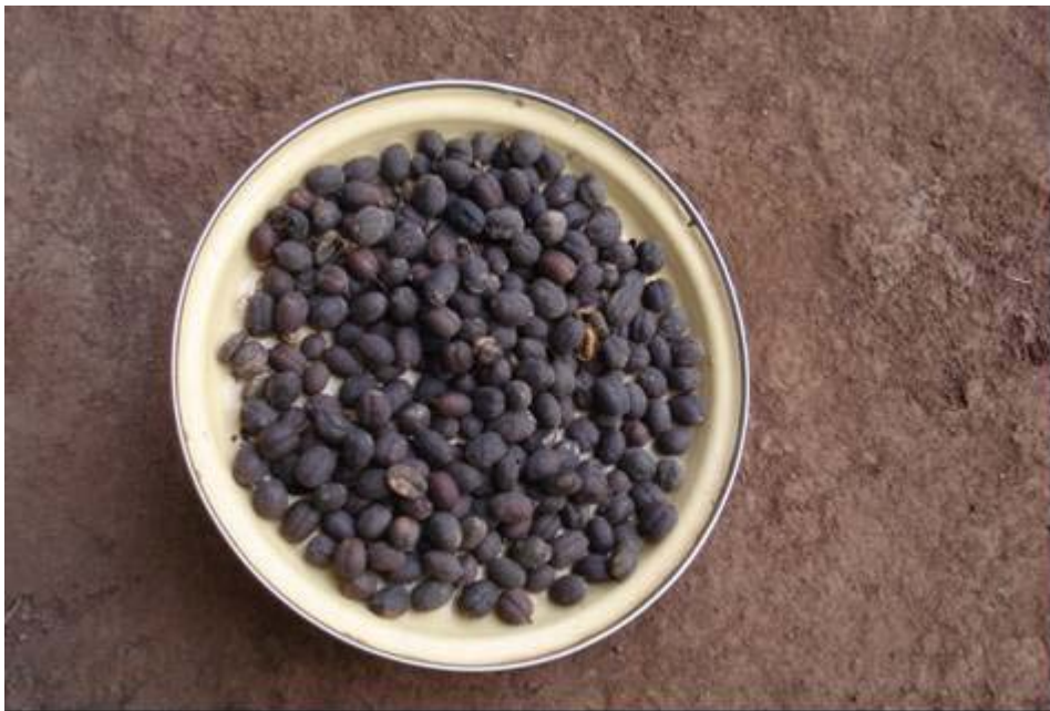
Figure 3. Dry coffee berries.