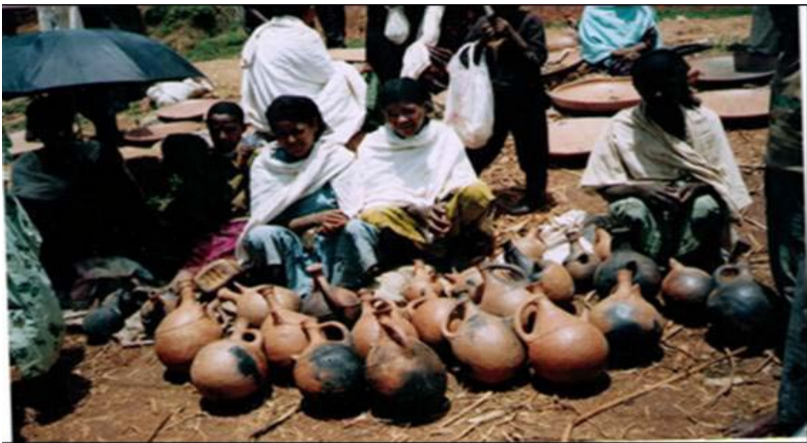
Figure 6. Potters selling Jabanaa at market place, Guyyi, West Wallaga.

The other useful pottery vessel in the coffee ritual is jabanaa (Figure 5). In rural areas coffee beans are toasted for making coffee. Normally, it is toasted on a small sized griddle known as beddee bunaa . The roasted coffee is then put in a wooden bowl (pistil) known as mooyyee bunaa for the grinding and thereafter it is ground by small mortar, muka mooyyee bunaa . Eventually the powdered coffee is added to boiled water in a clay pot as ( jabanaa ), which is over fire on hearthstones. When the jabanaa is still over fire, an appropriate amount of salt is added. The use of jabanaa for making coffee has continued in both rural and urban areas. As stated above, one of the reasons for the continuity is that jabanaa has no equivalent substitute.