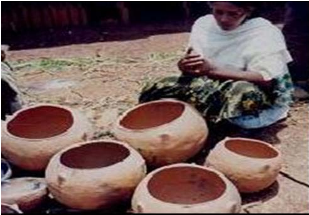
Figure 5. A potter at market for selling waciitii .

sacrifice. In this occasion, the coffee ceremony provides the community with a moment of unity and brings members back to their tradition, their own roots and their own identity. The coffee ceremony is also referred to as a school of socialization because it is during this occasion that the youths are told proverbs, stories, as well as thoughts, customs, and norms of the community. Furthermore, as the coffee ceremony is dominated by women it is an avenue for them to come together, discuss and handle social issues, and share ideas.