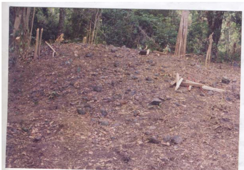
Figure 2. Iron slag mound of Ijaiye Orile.

According to Inawole (1999), the chemical analysis carried out on the iron slag collected at Ijaiye-Orile iron working site showed that the work on the site was of high grade, utilizing ore from a primary source (Figures 2 and 3). These findings indicate that the ore was mined directly from natural deposits in nearby sources.