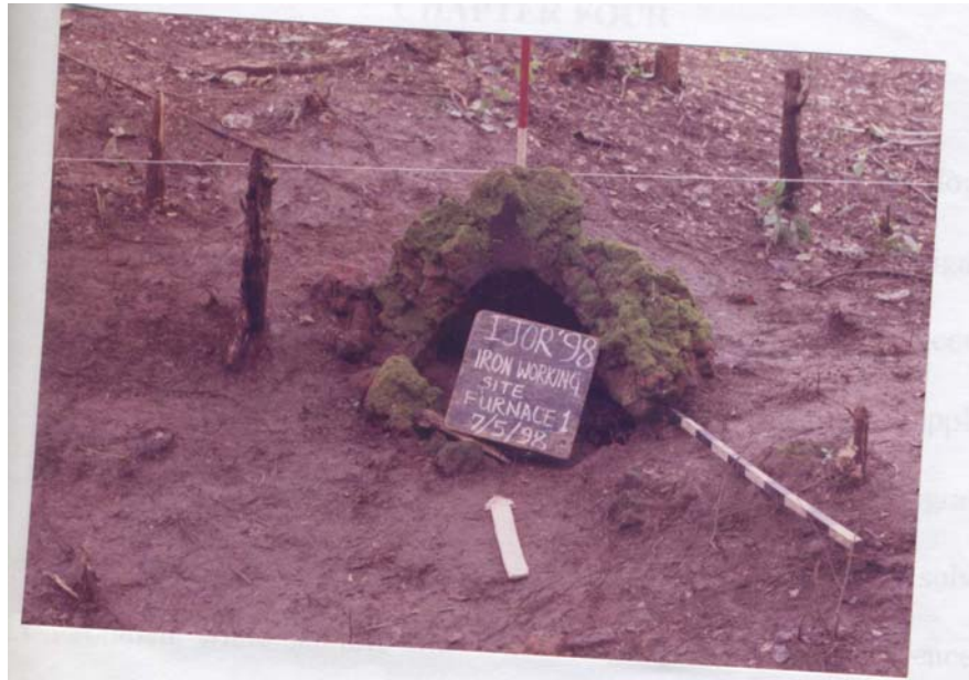
Figure 3. Ijaiye Orile iron working site and furnace.

The changes in land uses over time in Ijaiye-Orile could be attributed to three major factors: past political conflicts, transformation of the environment, and impacts of more recent colonial regimes and urbanization.