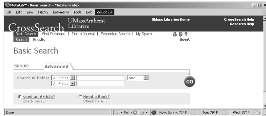
FIGURE 3. Example of the Basic Search Interface Agreed to by RIO Members