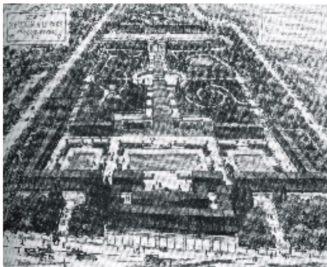
Figure 1: A perspective view of Burnap's original plan for Meridian Hill Park (Burnap, 1916)

Several published books were central to the neoclassical landscape movement and the development of sceniographic and iconographic tendencies: Charles A. Platt's Italian Gardens (1894), Edith Wharton's Italian Villas and their Gardens (1903), Charles Latham's The Gardens of Italy (1905) and a compilation of papers presented at the American Society of Architects conference in 1900 and subsequently published in a book of three essays, European and Japanese Gardens (1902). While Platt, Wharton and Latham brought their appreciation of Italian gardens to a wider American audience, Guy Lowell in American Gardens (1902) focused his arguments on the development of American style and the importance of its derivation from European precedents. Other books, such as Shepherd and Jellicoe's 1925 Italian Gardens of the Renaissance and Nichols 1928 Italian Pleasure Gardens , were later editions that answered the demand for additional literature on Italian gardens and helped to reinforce the predominance of the neoclassical style.