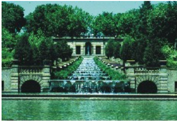
Figure 3: The cascades at Meridian Hill Park (Land Ethics, 1996)

The most enduring feature of the original design for the park were the cascades, clearly the most significant feature in the park and the one most easily identified as Italian Renaissance in influence (figure 3). However the origins of the design are much more difficult to divine. There are no documentary references to specific precedents for the version of the cascade that appears in the initial design drawings of 1913 and 1914. Since Burnap had not traveled to Italy at the time he produced the original design drawings in 1913, we must turn to the published accounts of the Renaissance gardens to provide some possibilities for the origins of the design. The most probable precedent from published sources was the cascade at St. Cloud, France, designed by Thomas Francine circa 1625. Pictured in Howard's discussion of French gardens and attributed to Le Notre, the cascade is similar in scale and form to Burnap's early drawings, with a central circular feature and a vertical terminus (Howard 1902). However, as the cascade is simplified and achieves its final form in 1920, the design can only be seen as an interpretive one, transcending imitation to apply the spirit of a Renaissance cascade to the given site. By that time Peaslee had acquired the personal experience of studying the villas, and modified the scale and form of those precedents into a cascade both larger in scale and simpler in form than his Renaissance examples.