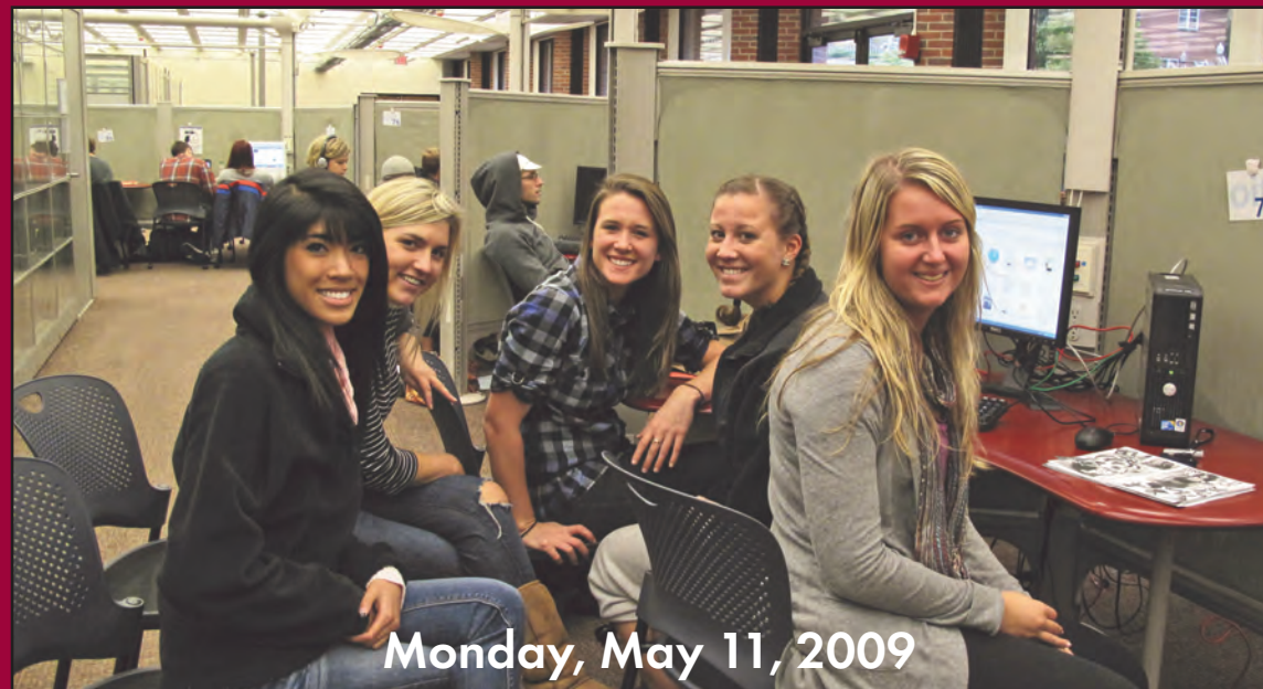
Monday, May 11, 2009