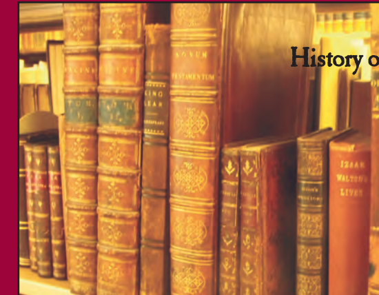
History of the Book Teaching Collection Launched Books come alive in Special Collections