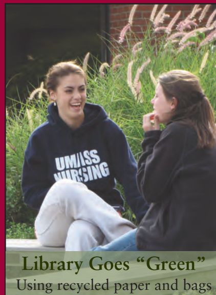
Library Goes "Green" Using recycled paper and bags

» Donations Hit All-time High of $1.75 Million Thanks to you and 5,794 other donors