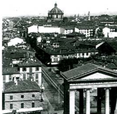
Milano, Skyline II