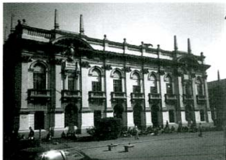
Politecnico di Milano

relaxation measurements in simple extension. In this way, methods for the measurements of mechanical properties on specimens of very small sizes are studied by microdynamometry. Also studied are the structure, morphology, physical and mechanical properties of new materials with segmented macromolecular structure, which can be obtained by polymerization of functionalized macromonomers.