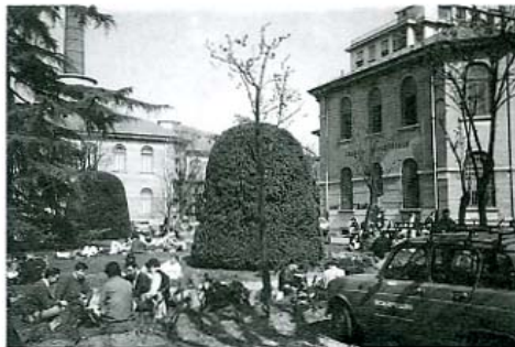
Students at the Politecnico

Another area of interest of Dr. Ferruti's group is the synthesis of end-functionalized oligomers to be used for preparing oligomeric derivatives of drugs and enzymes. In particular the following main lines of research are being followed: a) the introduction of original methods of reactive functions of already available oligomers, such as poly(ethylene glycols); and b) preparation of new end-functionalized oligomers of N-vinylpyrrolidinone and substituted acrylamides by radical polymerization in the presence of functional chain transfer agents. This chemical laboratory headed by Dr. Ferruti is equipped for polymer, as well as for organic synthesis, and has an FT-IR spectrometer, a U.V. spectrometer, viscosimetry measuring devices, a 1 H NMR spectrometer and a differential scanning calorimeter.