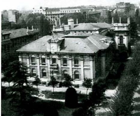
Advanced School of Polymer Science Politecnico di Milano