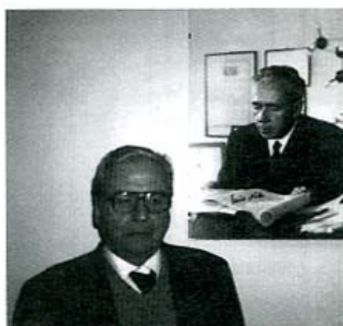
Mario Farina (with picture of Giulio Natta)

Polymer News , 1993, Vol. 18, p. 116-124 Photocopying permitted by license only.