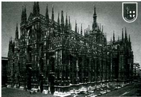
Milan, Il Duomo

facilities with different laser sources and a Cary 2400 spectrometer are also available. Photo-induced absorption measurements are also carried out; the laboratory is especially equipped to study the resonant Raman scattering of conjugated system.