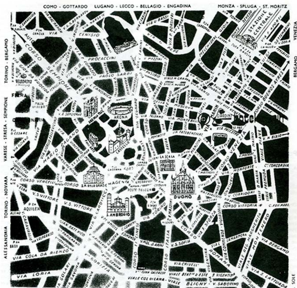
Center City Milano, Italy