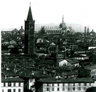
Milano, Skyline I