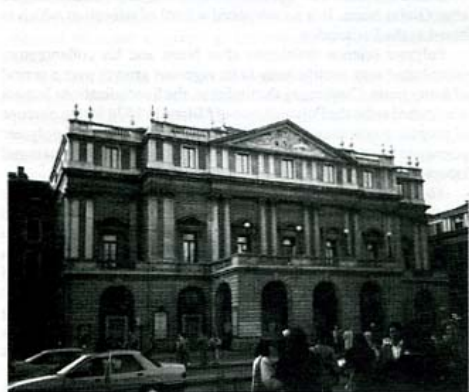
Opera of Milan, La Scala

A series of seminars on special topics are presented every year; the subjects are continually updated.