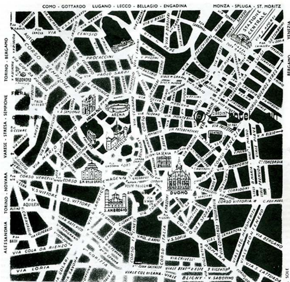
Center City Milano, Italy