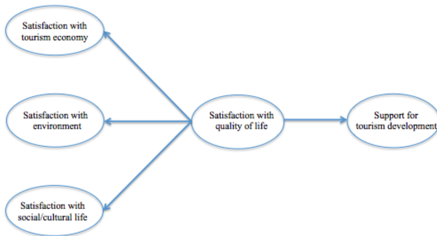
Figure 1. Proposed model of local residents' perceptions about tourism in a destination

This study utilized indicators about residents' satisfaction with QOL and their support for tourism from literature. Data were used to develop a structural equation model (Figure 1). The hypothesis of this study is that residents' satisfaction with tourism-related QOL indicators is positively related to level of support for tourism in the destination. According to the proposed model, local residents' satisfaction with QOL is composed of three domains: satisfaction with the tourism economy, satisfaction with the environment, and satisfaction with the social and cultural life of the community.