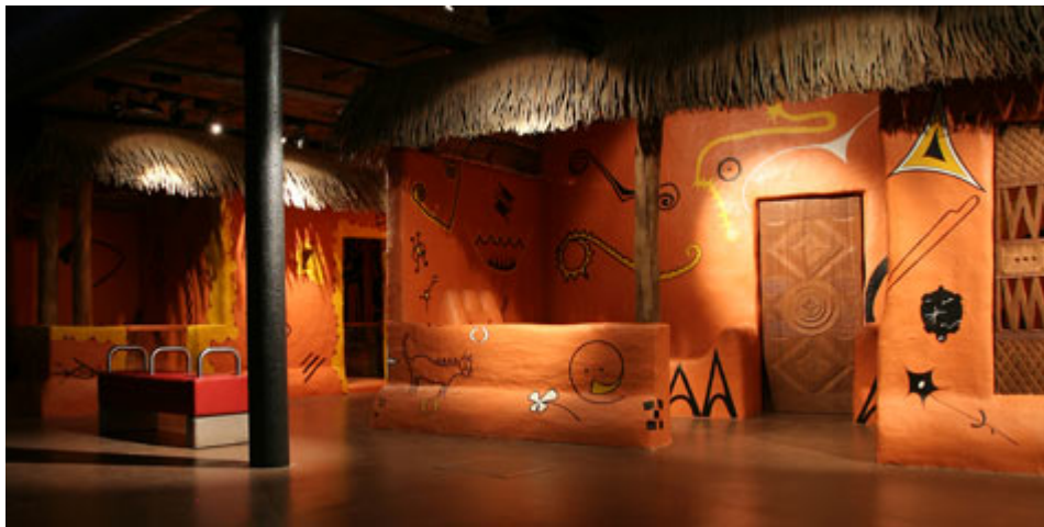
Reconstruction of an Igbo Village -- International Slavery Museum, National Museums Liverpool.

The International Slavery Museum in the Merseyside Maritime Museum, National Museums Liverpool, opened in August 2007 and has attracted plaudits regarding its innovative displays on the history of the Atlantic slave trade. The museum places the perspective of the enslaved African firmly within the minds of its visitors. Displays of traditional masks and audio-banks of music from the African continent are placed prominently near the entrance, whilst one of the first parts of the museum which is seen by visitors is a reconstructed Igbo village. In this reconstruction which contains detailed and well-researched representations of tribal huts and displays of artefacts, the vibrant culture of Igbo culture and by association West Africa is communicated to the museum's audience. This display is placed notably before the sections addressing the advent of the transatlantic slave system, the legacies of slavery and the existence of modern-day slavery.