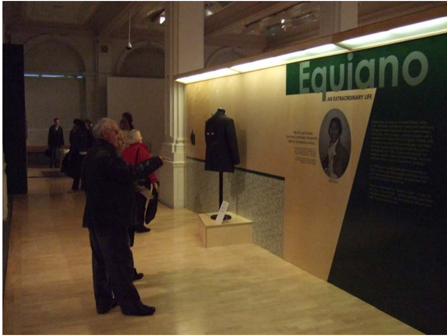
Display panel at the Equiano Exhibition