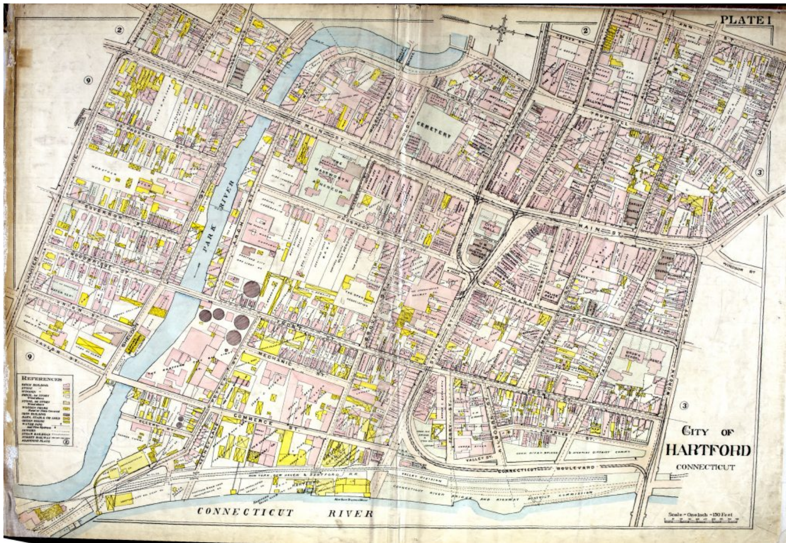
Map of the City of Hartford, Connecticut (1909)

https://www.flickr.com/photos/uconnlibrariesmagic/albums/72157631791938428