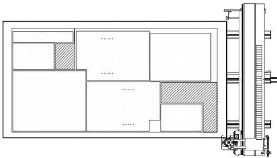
Fig. 2. Nested Parts for CNC Cutting from Sheet Stock

Over the decades, the ability to maximize the number of individual parts from stock lengths/sheets of raw material has created computer numerical control (CNC) manufacturing of parts, layout and cutting practices with improved environmentally sustainable practices. This process is called nesting, as the software puzzles together two and/or three-dimensional pieces within limited constraints. From linear elements, like 2x's for roof trusses, there is an average 10% efficiency, which means less waste and a healthier planet. We may also use this same software to pack elements in a flat or volumetric matrix, much like the game "Tetris," to "nest" these multiple elements into the most compact volume for shipping. Ikea is the poster child for this process within popular culture. [3]