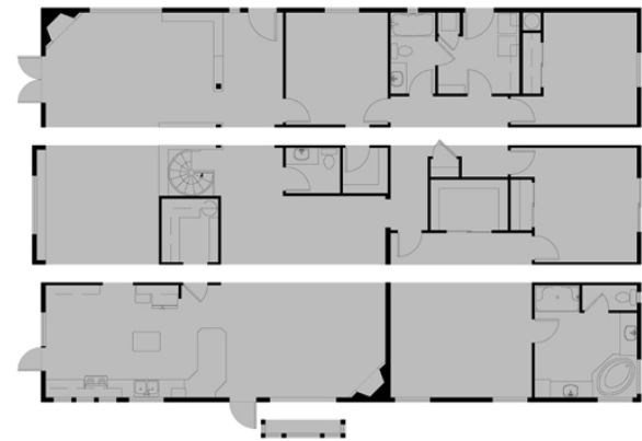
Fig. 1. Atelier Z, Karsten KE-03 modified, 2003.

The rules that manufacturing companies follow are quite simple, which is why they have become so very profitable with modular construction of multi-family housing, hotels, and plan-booked single family homes. Anything within the standard rectangular volume can be tweaked slightly, but cannot alter any structural paths. Beams have to fit between head clearances and the top of the module. Anything outside of the rectangle is a site-built feature at the owner's additional expense, such as site work, bay windows, dormers, etc.