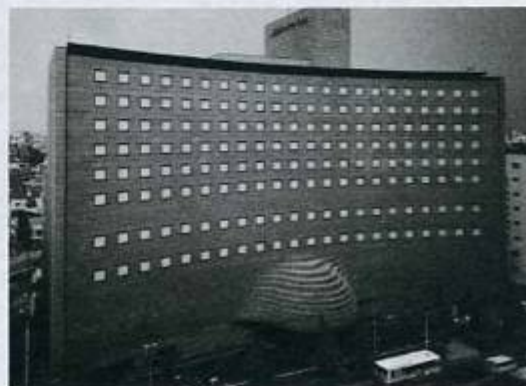
Tokyo Garden Palace Hotel, location of the seminar.

Robert H. Grubbs (California Institute of Technology) entitled "Applications of Organometallic Reagents in Polymer Synthesis". He mentioned that numerous reactions in organometallic chemistry in the past few years that are applicable to the synthesis of new polymers with controlled structures have been discovered. Many of the best defined systems involve catalysts for ring opening metathesis polymerizations (ROMP). These well defined catalyst systems can be used to polymerize a variety of monomers. An excellent route to polyacetylene was found in the bulk polymerization of cyclooctatetraene. This route provides a solution to many of the fabrication problems associated with the standard routes for the preparation of insoluble and infusible polyacetylene and allows