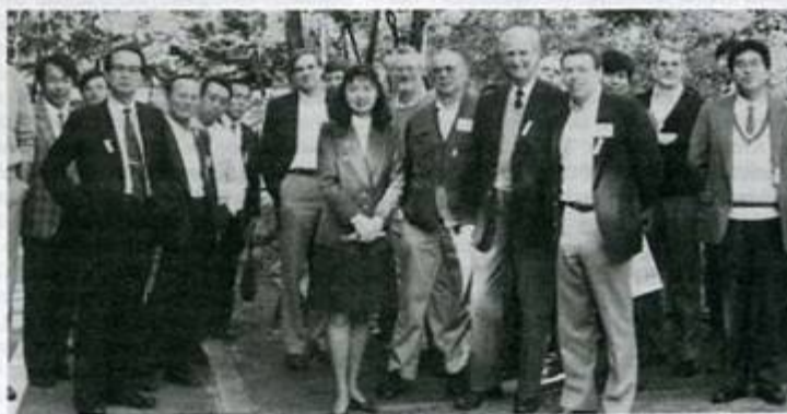
Excursion to Hakushu, Nagano Prefecture.

"The Preparation of Electro-Driven Chemomechanical Systems Using Polymer Gels" was described by Yoshihito Osada (Ibaraki