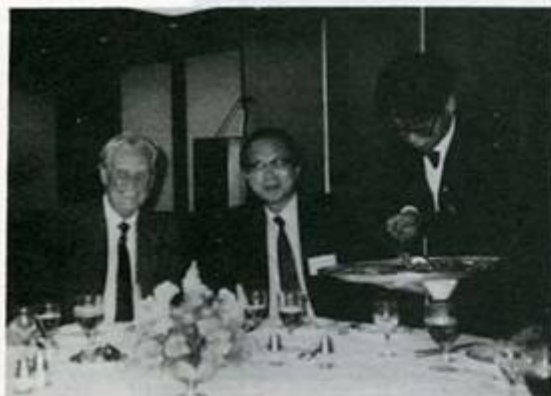
At the banquet.

were prepared from orthosilicate esters, a precursor of silica gel in a so-called sol-gel procedure. The original products are soluble in organic solvents, they are transparent glasses and the hybrids of silica gel with organic polymers with up to 50% silica have been prepared. On pyrolysis of these materials at 600 C highly porous silica gels with controlled pore size have been obtained.