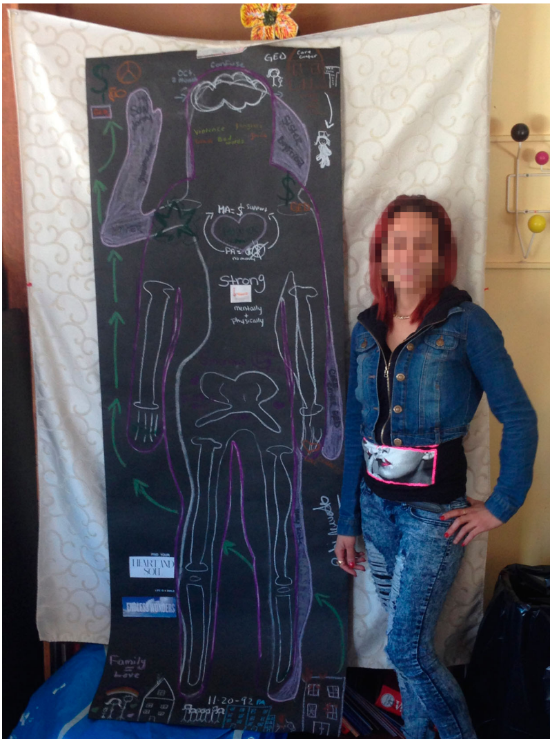
Figure 2. Body map example from Hear Our Stories project.

are presenting the body map work as part of a research project that is governed by our institutional human subjects review board, which expects that we protect potentially vulnerable participants through their anonymity. While the erasure of the subject is one issue, so are our institutional requirements to protect subjects, especially those defined as vulnerable, even as engagement and arts shift into our research endeavours. We appreciate these different ethical standpoints and that different contexts require different treatments of visual material.