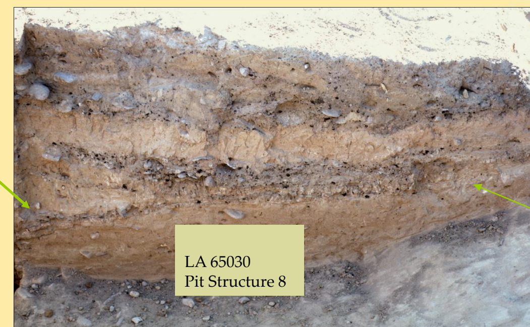
Roofing and human bone layer

LA 65030 Although it has the largest artifactual sample from the project, LA 65030 has the smallest disarticulated remains sample of the three sites discussed here. Most of the remains (300 of 400) are from the fill of one of the eight pit structures at the site. The site was occupied from mid Pueblo II through early Pueblo III. This assemblage comes from the fill of one of the earliest, mid Pueblo II structures. Six burials were recorded from the pit structure, 3 of which were intact. The burned roofing layer contained a large quantity of human bone in varying states of disarticulation. Carnivore damage is extensive, affecting at least three individuals. Disarticulation was exacerbated by mechanical trenching, but was clearly present before. Some of the burning is heavy, indicating the absence of flesh when burned. Other bone is remarkably sound, indicating minimal exposure to weathering. This bone shows impacts from being moved during site occupation, supplemented by carnivore activity.