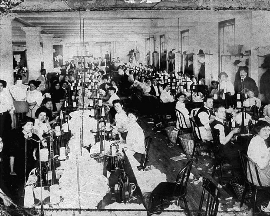
24. A shop floor in a New York garment factory.

fall, Triangle's owners struck back aggressively. Pickets were verbally and physically harassed by hired thugs and the police, and dozens of strikers were arrested. To add insult to the injury of incarceration and fines, the arrested women were taken to Jefferson Market Courthouse at Sixth Avenue and West Tenth and tried in Night Court, a tactic meant to intimidate strikers through association with the prostitutes whose cases usually filled that court's dockets. "No nice girls go there," one arrested shirtwaist maker asserted. 48