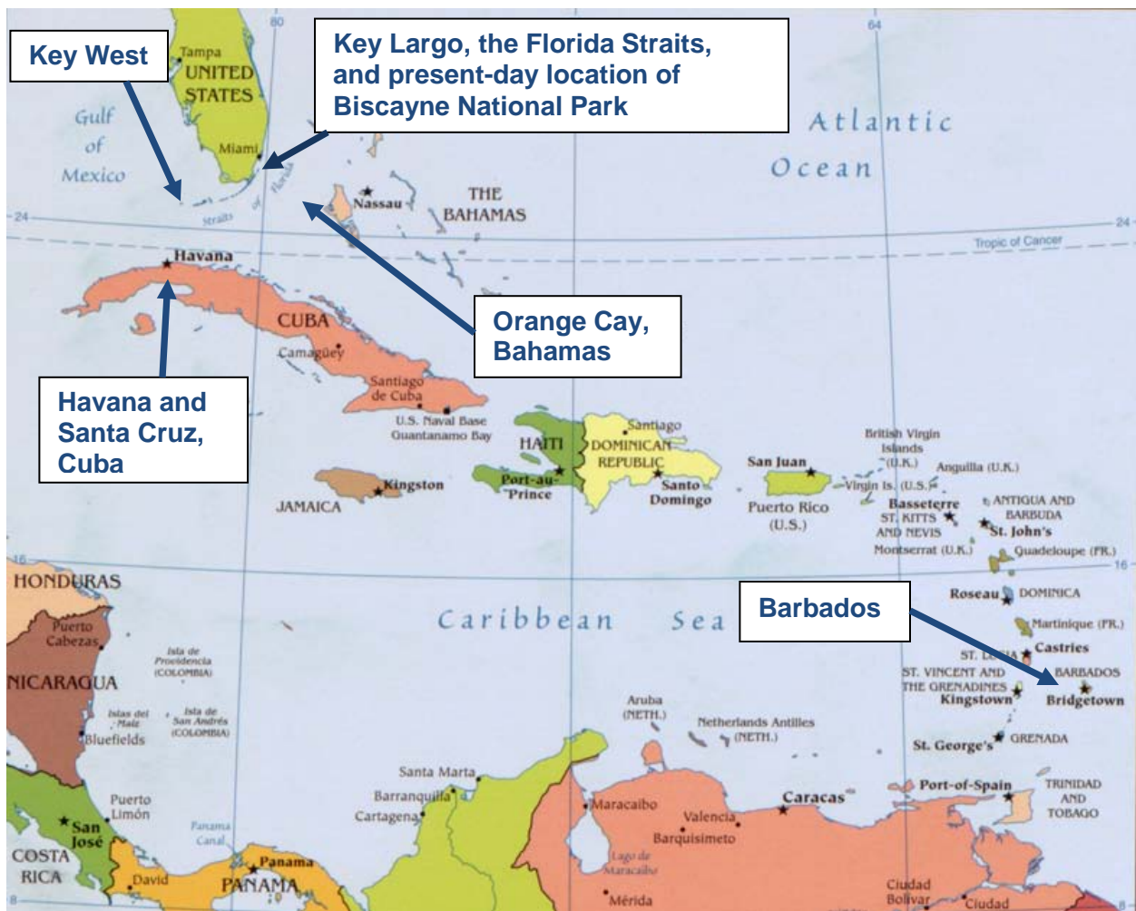
Figure 2. Map showing Caribbean locations related to the last voyage of the Guerrero and movement of other related vessels (image by C. Fennell).

Two days later at Orange Cay, the Bahamas, a more real object came into view: the laden Guerrero . The brig was sailing from the north down the Florida Straits, attempting to evade the British patrolling the long north coast of Cuba. The Guerrero had only 250 more miles to sail before reaching Havana (Fig. 2). It was noon. From the Nimble 's log: