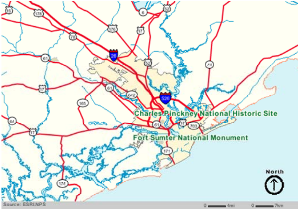
Figure 2. Map depicting the location of Sneec Farm.