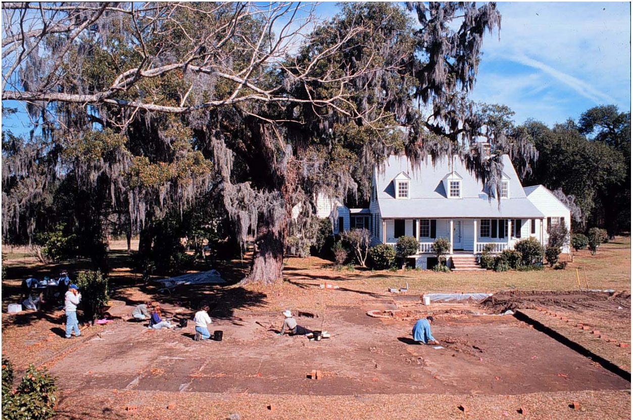
Figure 1. Charles Pinckney National Historic Site.

adjusted to any location. Starting from individual households and groups of households to larger community allows for family comparison, subcultural comparisons, and then bridges to regional and global inclusions.