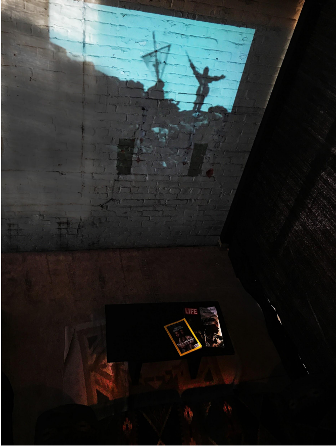
Figure 3, The Private is Political , looped video installation, 2018