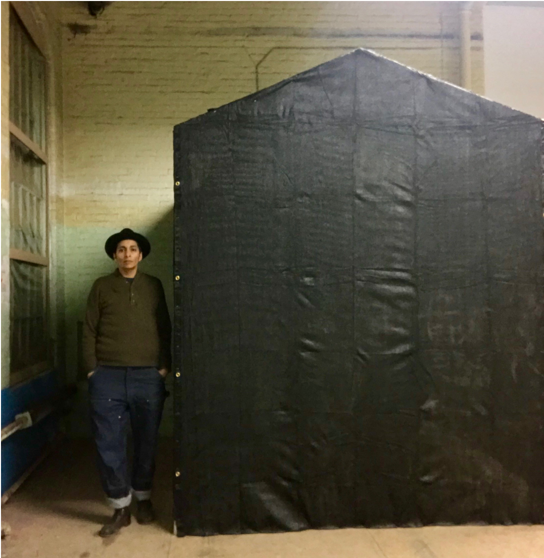
PHOTO OF THE ARTIST OF WORK