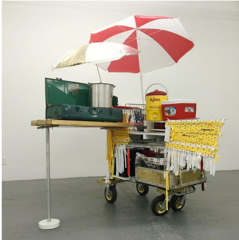
Figure 5, Shopping Cart No.2 , Mixed -media, dimensions variable, 2017

Shopping Cart No.2 includes air-casted wheels that provide greater mobility and a gate that latches open and closed to more easily access the insides of the cart. The cart has two large umbrellas, creating shade for the cart operator. A transportable table attaches to the side that provides counter space for a portable Coleman propane stove that can cook traditional foods like Tamales--an Ancient Indigenous cuisine.. Within the bed of the cart there is a wood pallet reconstructed as a shelf. This is used for food production and preparation. Cart No.2 also has recycled t-shirt strips, woven into the bed of the cart, as well as elaborate gears that operate on a car battery. The battery generates electricity to power a 200 watt stereo system that jams to the looped beat of the Kumbia Queens. Cumbia is a Latin-American dance, practiced originally by African slave populations in the coastal regions of Columbia. This music became very popular throughout Latin America and eventually became known worldwide. It was primarily listened to by working and “lower class” people. The