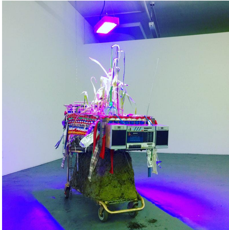
Figure 4, Shopping Cart No. 1 , Mixed-media, variable dimensions, 2017

appearing similar to Tonantzin “our mother” who is an Indigenous deity. 25 Juan Diego’s encounter is credited with the mass Catholic conversion of Indigenous people in Mexico. Scholars contest this allegation and claim that the Virgen de Guadalupe may have been fabricated to strategically expand Spanish conversion.