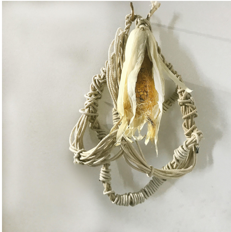
Figure 7, La Maize, Mixed Media, 2018