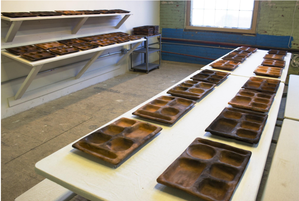
Figure 6, Table Remains , Mixed-media, variable dimensions, 2017-18