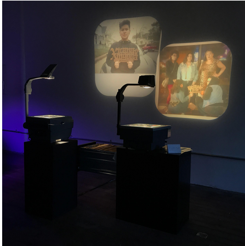
Figure 8, Old English Modern Mestizaje , Mixed Media, 2018

Unapologetically.” This phrase summarizes the meaning of this project. A collaborative endeavor, it features members of the Joteria (Gay) Community that are queer Xicanx and allies, and others from across the United States. Each phrase was made into a customized plaque. Each plaque was laser cut out of MDF, then spray painted gold. The phrases themselves varied in content and language. In fact, three separate languages Spanish, English and Nahuatl were offered. The plaques were mailed and hand delivered to participants with a directive, “capture a digital image of how you would like to be represented.” The installation required: two overhead projectors and a file cabinet where the photographic transparencies were filed. Participants had an opportunity to choose which photographic transparencies they would like to project onto the wall. This experimental photographic work channels the documentary photography of the late Laura Aguilar and her portraits from the early 90’s as well as Catherine Opie’s work, in her The Regents Project .