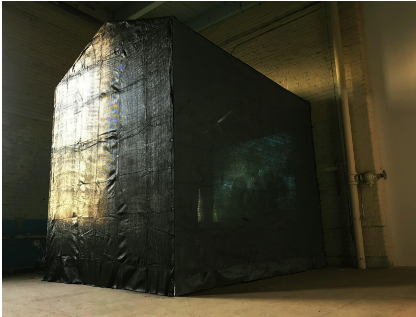
Figure 2, The Private is Political , looped video installation, 2018

My interest in using film in the Private is Political has been shaped by artists who tackle the subjects of colonization and the legacies of white supremacy. The works of Kara Walker and Simone Leigh, Thatched Hut have been inspirational. 18