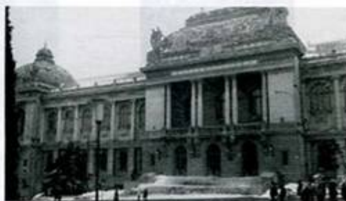
Alexandru Ioan-Cuza University, Iași.

terpenes, proteins, polyphenols, and hemicelluloses). Efforts are being made to convert the byproducts into different useful products such as resins, organic fertilizers, sugars, and biologically active compounds. Cellulose is modified by esterification or grafting. Lignin separated as liginosulfonate is a byproduct in papermaking; it is investigated as a potential starting material for adhesives, soluble organic fertilizers, and surfactants. Investigations are being carried out to develop specialty fibers, especially new versions of carbon fibers. Investigations are also being carried out for the design of new adhesive compositions and composites (interpenetrating networks) based on cellulosic fibers and synthetic fibers in the principal of nonwoven materials. The scientific results of the laboratory are published primarily in "Cellulose Chemistry and Technology," an international journal founded by Professor Cristofor Simionescu in 1965; it has an international editorial board (A. Bjorkman, H. F. Mark, B. Rånby, K. Kratzl, T. E. Timell, et al.) and is published by the Academy of Sciences of the SR Romania.