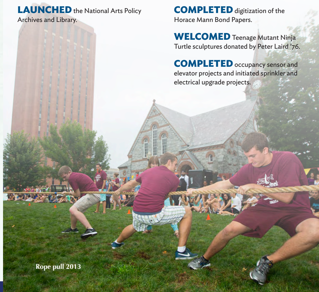
Rope pull 2013