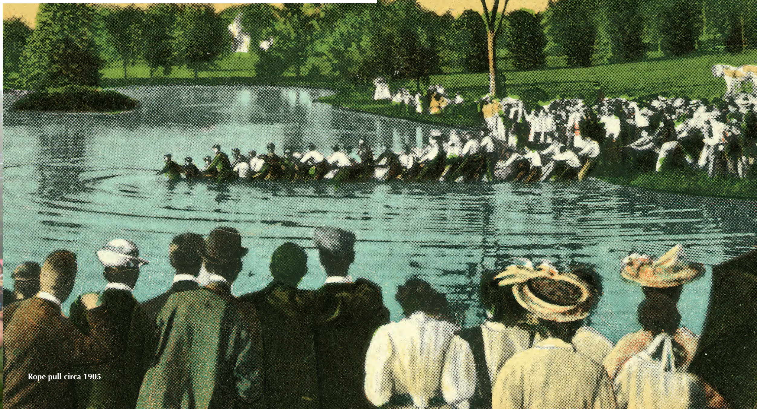
Rope pull circa 1905