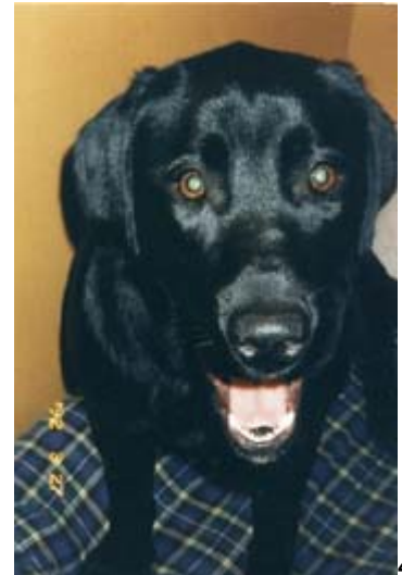
Emmie, our dog (2002) (444)