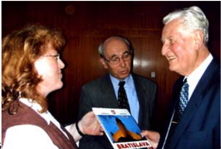
My last lecture- in Bratislava, April 2006 (465); "Les Prix Nobels"