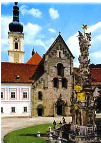
Stift Heiligenkreuz (479)