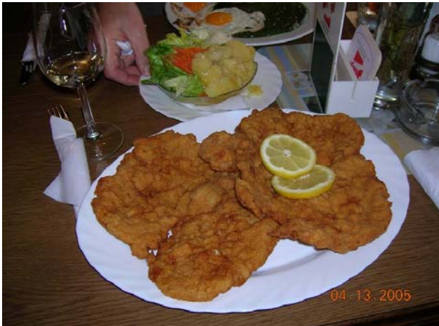
Wiener Schnitzel at Gasthaus Maschler (473)