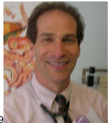
The Boyden's (neighbors, #18 Canterbury Lane (449)