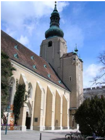
Pfarrkirche Baden (475)