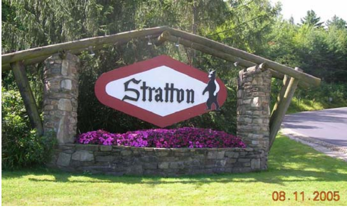
Stratton, VT, Entrance (439)