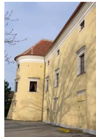
The Castle Part (1492 AD) of the Hotel (478)