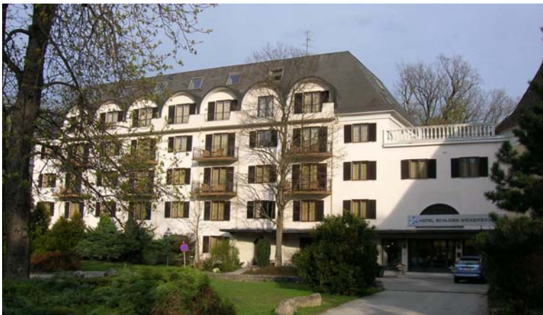
Hotel Weikersdorf, Baden (477)