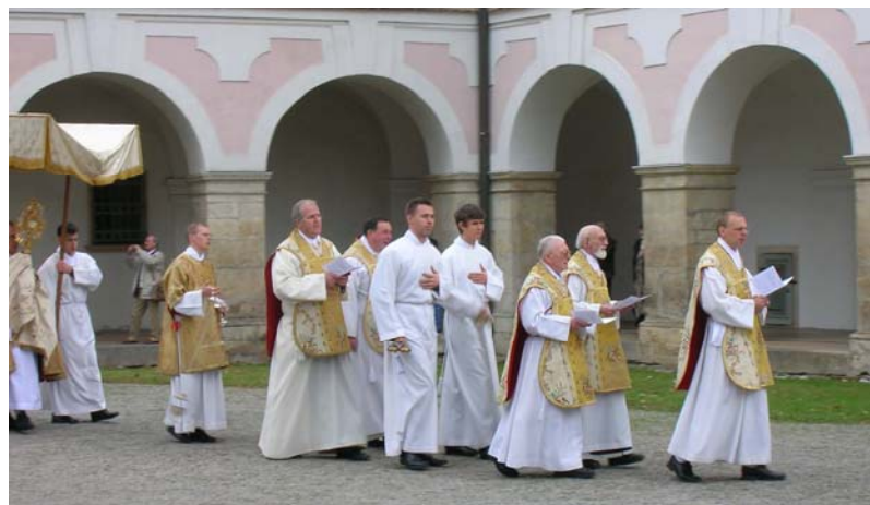
Easter Procession at the Cistercian Monastery Heiligenkreuz (480)