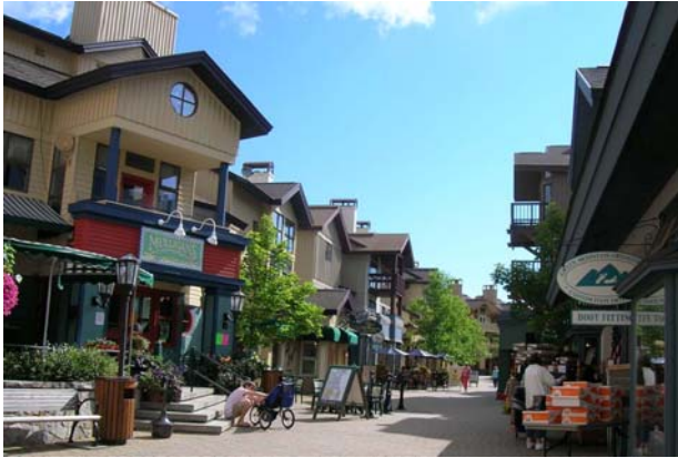
Stratton Main Street (441)