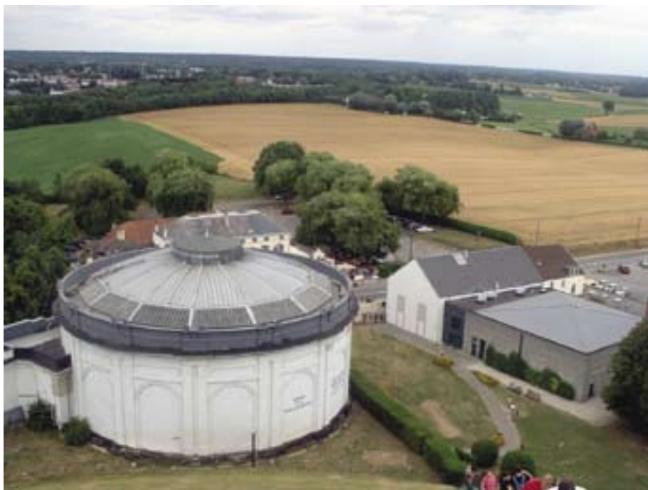
The Waterloo visitors' center, slated for demolition, stands next to a 1912 neoclassical building housing a 360-degree panoramic painting of the battle that will remain at the site.

On the plateaus of eastern Brazil, stone dwellings tell the story of a nineteenth-century diamond rush