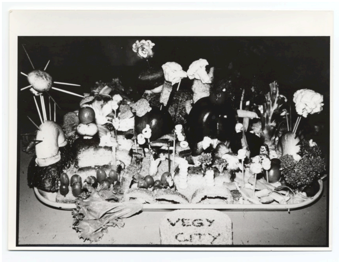
Figure 16: WSPA 1976. Vegy City (sic) campus model. Model constructed of vegetables and bread. [SSC RN 7264]