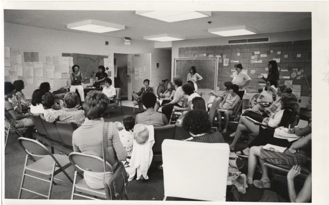
Figure 2: WSPA 1975. All-school meeting, St. Francis College, Biddeford, Maine. [SSC RN 7253]