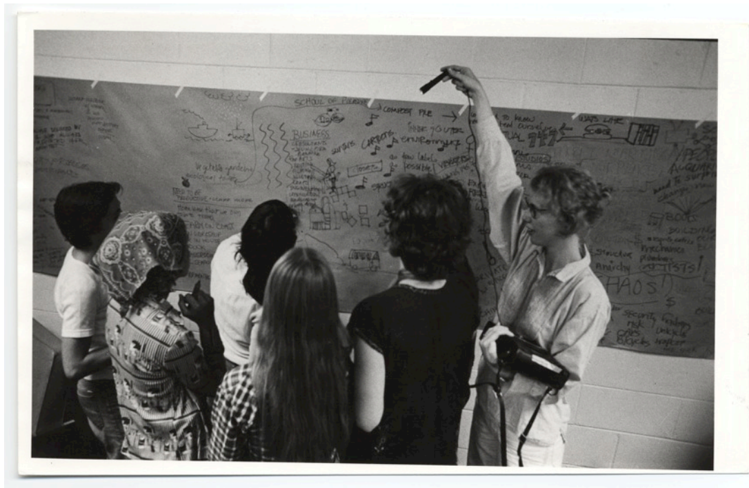
Figure 4: WSPA 1975. Brainstorming session, Women and the Built Environment core course. [SSC RN 7254]