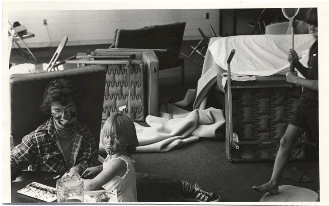
Figure 17: WSPA 1975. Child care. [SSC RN 7262]