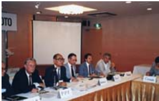
198 Council Meeting Polymer Summit (198)