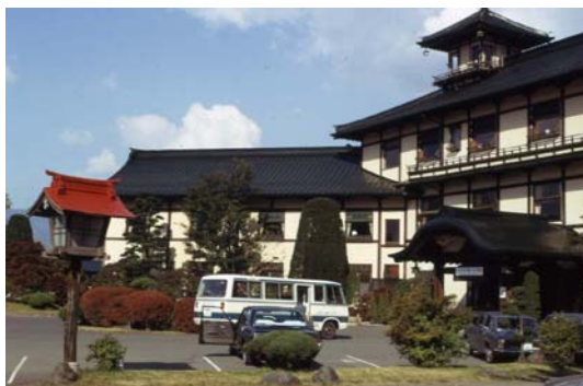
First US-Japan Symposium on Polymer Synthesis (190) in Mountain View Hotel. Hakone-Kawaguchi-ko Japan 1972 (191);