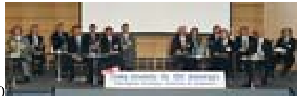
201 Osaka University 70 th Anniversary 2001 (201)