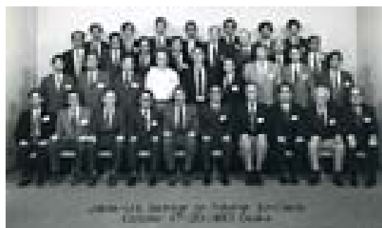
2 nd Japan-US Symposium Pingree Park, CO (192); 3 rd U.S.-Japan Symposium in Shin-Osaka, 1983 (193)