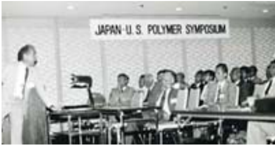
196 U.S.-Japan Meeting in Kyoto 1985 (196)