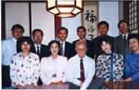
221 Dinner of OV Kansai Group (221)