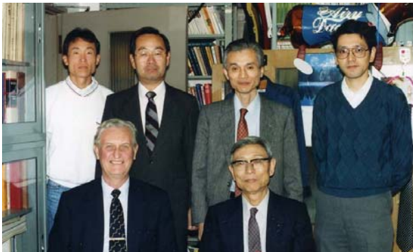
225 With Nozakura and Hatada's group (225)