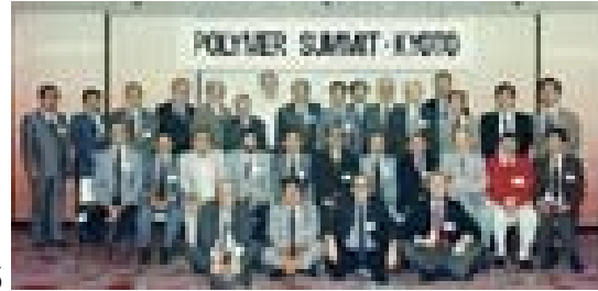
197 Polymer Summit, Kyoto 1988 (197)