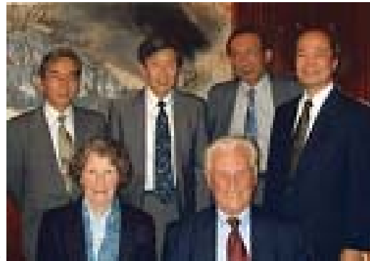
224 Dinner OV Tokyo Group 2001 (224)