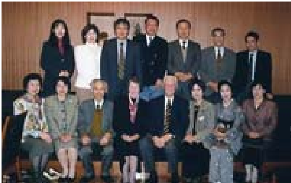
223 Dinner of OV Kansai Group 2001 (223)